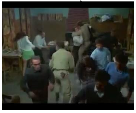
Pic. 5 Description

In the fifth picture (pic. 5), a full-scale fight appears to be taking place in the tavern, where the sergeant has grabbed from the throat two men from Evdokia's company, and the other customers of the tavern are leaving the place in haste.