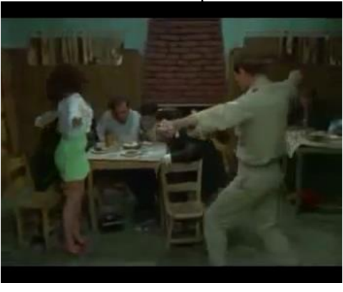
Pic. 3 Description

In the third picture (pic. 3), the leading actors appear to be dancing Evdokia's Zeibekiko inside a tavern.