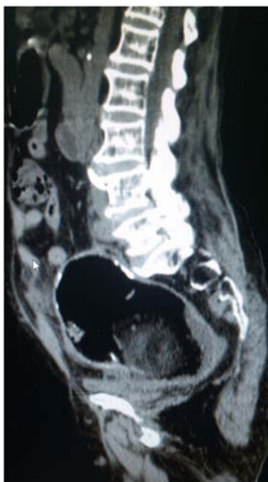
Fig 1 CT (sagittal section) of pelvis showing ovarian

Ultrasound pelvis showed a complex adnexal mass with solid cystic components seen in the pelvis measuring 9 x 7 cms with internal septations. Vascularity was seen in the cyst wall and the septations. Thus, bilateral ovaries could not be visualised separately. Minimal ascites present.