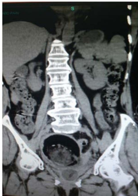
Fig 2 CT (coronal section) of Pelvis tumor