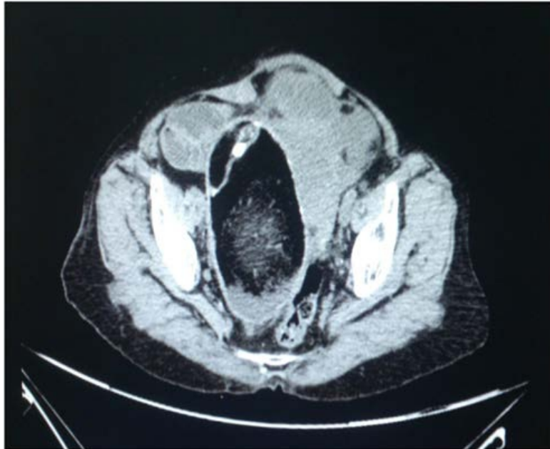
Fig 3 CT (transverse section) of pelvis.

CT pelvis showed a well differentiated thin walled lesion 10 x 7.2 x 13 cm with mixed fat and soft tissue density of 5 x 4 cm within it. These features suggest a right dermoid cyst. An ill differentiated lobulated lesion of 9 x 7 x 9 cm with solid and cystic components in the mid line of pelvis and which is slightly towards left side is seen. These features are suggestive of ovarian malignancy. (Fig 1,2,3)