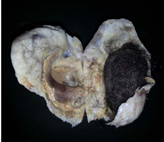
Fig 4 Gross appearance of the mature cystic teratoma showing hair and sebaceous material.