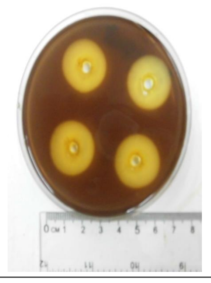
Figure 1: Enzyme production (amylase, pectinase, cellulase and phytase) by the selected Bacillus strains. The agar wells were inoculated with the bacterial suspension. The appearance of clear zones after 48 h of incubation at 30°C around the wells indicates enzymatic activity.

The 42 presumptive Bacillus spp. showed different production levels of the studied enzymes indicated by the presence of halos diameters ranging from 0.8 to 3.5 cm around the wells (Fig:1).