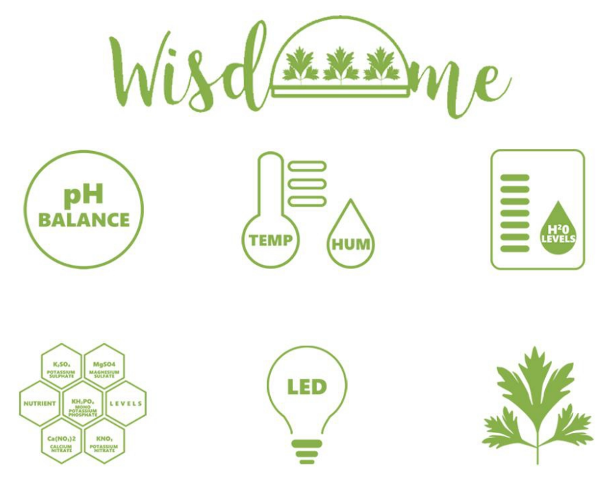
Figure 1. Graphic user interface for mobile application

In this section, we introduce our aeroponics system using IoT devices including its three main components, mobile interface, service platform, and IoT devices with each sensor.