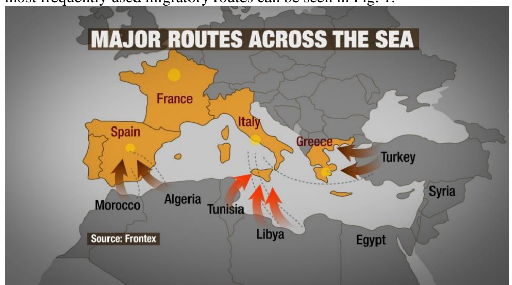
Fig. 1: Sea routes most frequently used by migrants.

modified due to gradual changes in frontier, political, international and security conditions. The original NORTH ROUTE is no longer used in the context of the current migrant crisis. Migrants have found a new north route to get to Europe passing Scandinavian countries, especially Sweden. The most frequently used migratory routes can be seen in Fig. 1.