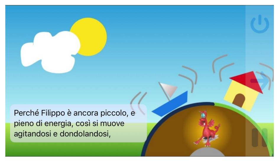
Figure 2. Methodology is storytelling, gaming, use of information and communication technologies, innovative teaching.

All Saving yourself apps are enriched with original designs, suitable for the