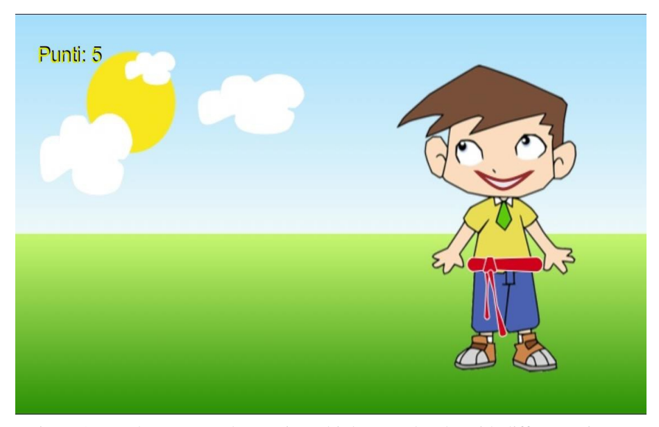
Figure 3. Another engage element is multiple game levels, with different prizes: a green belt, a red belt, a blue belt, a safety star.