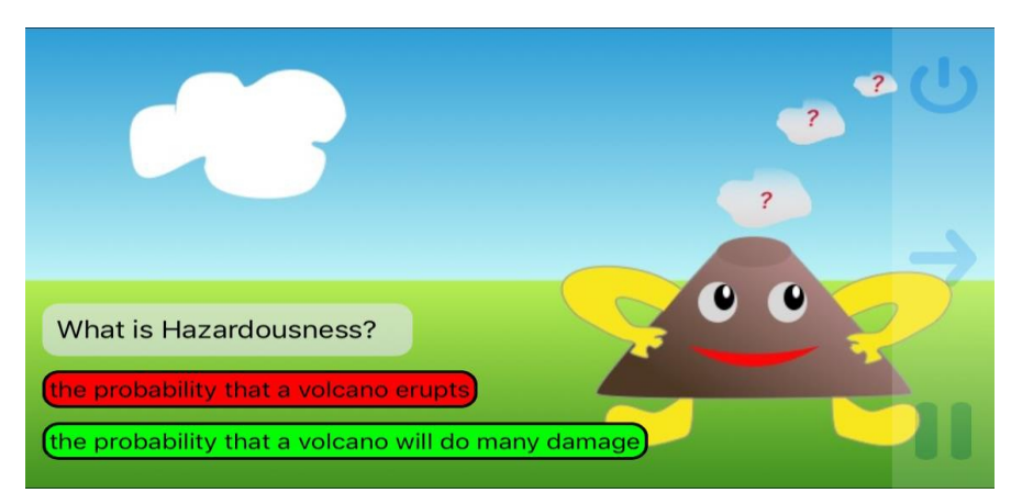
Figure 4. Immediate feedback: wrong answer is indicated in red, while the correct answer appears in green.

With GIFs, the geophysical mechanisms are clarified (Fig. 5), so it is easier to defeat frequent misunderstandings. In particular earthquake version aims to get aware and responsible informations, to avoid panic, to keep a healthy caution.