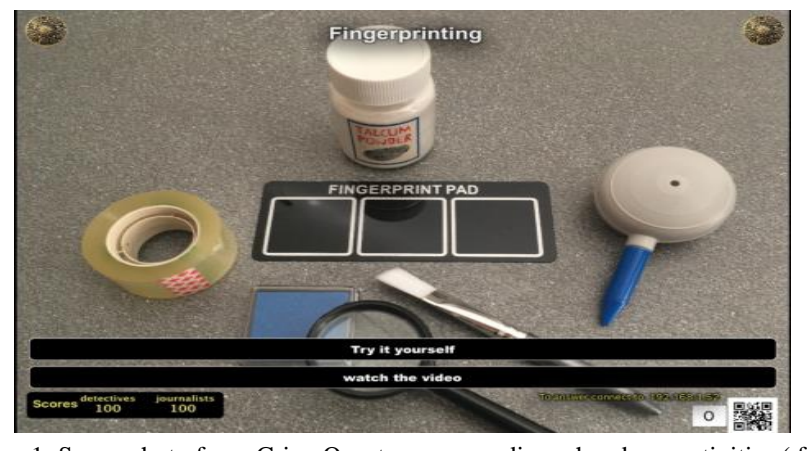
Figure 1: Screenshot of one CrimeQuest page regarding a hands on activities (fingerprint detection).

CLIL works with meaningful, challenging and authentic context that can motivate learners much more than traditional approach. Real world contexts engage students because they provide suitable learning environments for problem-based learning. CLIL scaffolding reinforces students' learning. They need scaffolding (Böttger, H., Meyer O., 2008) in order to improve language. Scaffolding is a powerful teaching tool; in fact facilitates students in understanding the content and the language in the task and enables learners to complete exercises by providing correct supportive structures. Scaffolding, besides, supports the enrichment of specific vocabulary and entire phrase construction by providing motivation, enthusiasm and language proficiency enhancing skills. It promotes the interaction between learners that begins to communicate with each other in an authentic way, stimulating thinking skills together with a specific topic glossary. The resulting outputs consist in enhancing fluency in communication and in increasing self esteem.