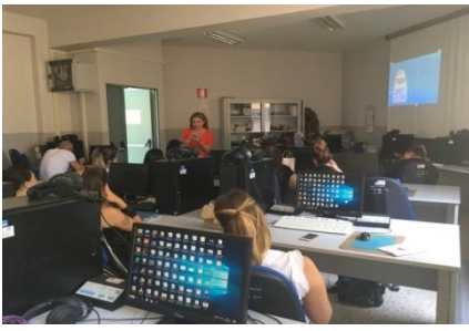
Figure 3 A whole class following the game with an IWB

The game can be played in a laboratory to accomplish one or more hands-on activities or in a classroom simulating a workshop activity.