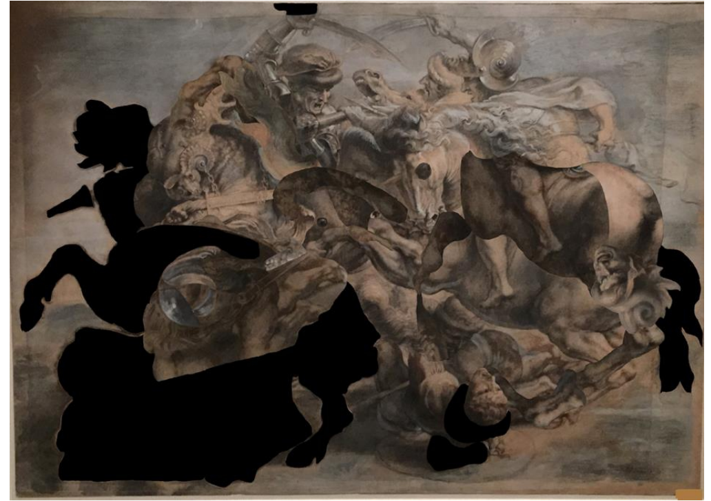
Fig. 3 Image after drawing elements moving

Finally, as a result, the image of the brain with its anatomical structure precisely repeating their natural disposition is obtained (Fig. 3, 4).