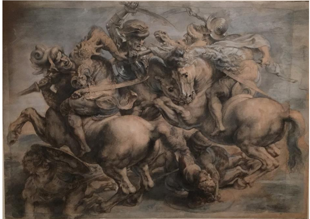
Fig. 1. Drawing by Peter Paul Rubens – copy of "The Battle of Anghiary" by Leonardo da Vinci

Since the individual details of the drawing matched the anatomical elements of the human brain we decided to perform an anatomical interpretation (Fig. 4-1, 2, 3, 4, 9, 10, 12, 22, 24, 25, 35, 39). With the help of the program Paint X we were able to move 23 elements of the drawing. The details of the obtained image (Fig. 3) are compared to the anatomical structures of the human brain in the lateral view.