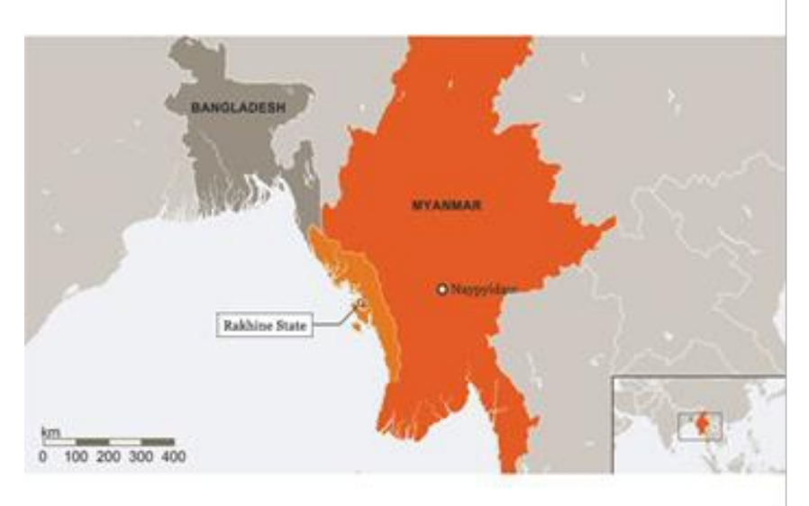
Figure 2. The Map of Bangladesh and Myanmar showing the state of Rakhine

access to the Bay of Bengal and Indian Ocean, through which it has turned it into a navigation hub for many countries of East Asia, South East Asia and South Asia particularly China and India. Geopolitically, the state of Rakhine is so important for Myanmar and other countries including USA, Japan, South Korea, and the European Union. There have been published huge reports that Rohigyas' evacuation from the state of Rakhine was for attracting foreign investments and infrastructural development, for oil and gas exploration, and for constructing gas pipelines between Myanmar and China and between Myanmar and India. Land was grabbed by the military through persecution from the Rohingyas to attract foreign investments in the state of Rakhine. Already, the state of Rakhine is being used by China and India in many ways such as ports, electric power plants, marine drive, tourism, and special economic zones.