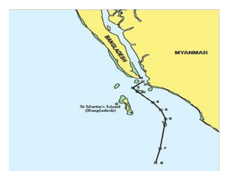
Figure 4. Sketch map composed by ITLOS showing St. Martin's Island's effect on the drawing of a territorial sea boundary between Myanmar and Bangladesh. The tribunal gave the island no effect on the EEZ and continental shelf boundary.

Regrettably, it can be said that the tribunal's achievement in attracting this comparatively low-stakes case might truly discourage larger powers' willingness to come into its judgment. ITLOS has no longer been a blank slate onto which both parties can anticipate their hope for results. Its verdicts on maritime border disputes, along with those of other bodies, have developed into a recognized body of jurisprudence on the issue. Parties to disputes gradually have at least a common idea of what the result of their case might be, and they are unlikely to come into trial, if they might not like the outcome of judgment (Watson, 2015). However, this notion has been proven through the judgment of ITOLS on Bangladesh-Myanmar maritime dispute.