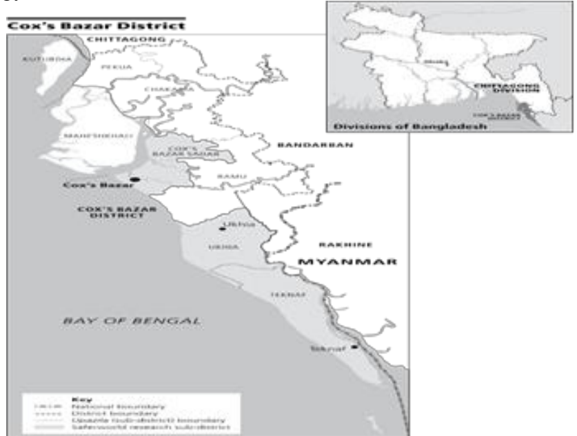
Figure 1. Bangladesh Myanmar Border, Source: Wikipedia (Also cited in Rashid, Ahamed & Rahman, 2020)

The new democratic government has been pursuing its foreign policy objectives with more firmness and deft. Daw Suu Kyi visited Beijing and ASEAN capitals, and in September she visited the USA. These visits indicated her priorities as well her eagerness to develop a personal rapport with the world leaders (Chow, 2016). She convinced the Obama administration to lift economic and political sanctions. Accordingly, the USA lifted most of the sanctions in October 2016 (Ahmad, 2017). Her diplomacy also worked when China, which was strongly supported by Russia, blocked a U.N. Security Council statement on Myanmar. The situation in Rakhine state is very worrying as the country's armed forces are carrying out a brutal attack on the Rohingya ethnic minorities (Reuters, 2017; Ahmad, 2017).