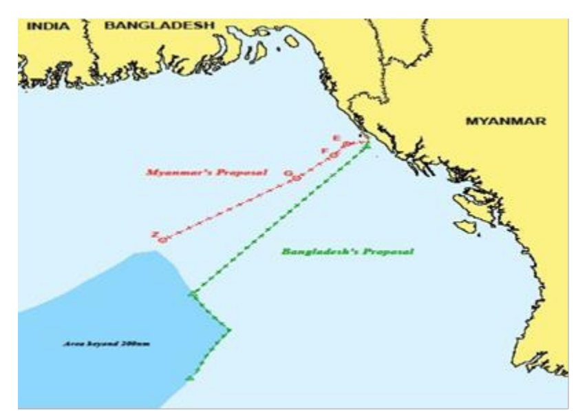
Figure 3. Sketch map composed by ITLOS illustrating the competing claims of Bangladesh (green) and Myanmar (red).

However, the treatment of St. Martin's island came in for robust criticism in the single opinion of Justice Zhiguo Gao, China's appointee on the tribunal, who explained the judgment to give full effect to the island in demarcating the international seas. This is aimed at overlooking it in demarcating the EEZ and continental shelf boundaries as "wrong and unacceptable." Gao further commented that the outcome of the judgment was unfair to Bangladesh, and that the island must be given half effect in demarcating the greater maritime boundary. In his separate view, he gave distinct weight to the island's degree of economic progress, the size of its inhabitants, and its closeness to the mainland, where he implied that in his opinion, not all islands are created equivalent for maritime boundary demarcations for small islands in undecided and disputed waters elsewhere in Asia (Watson, 2015).