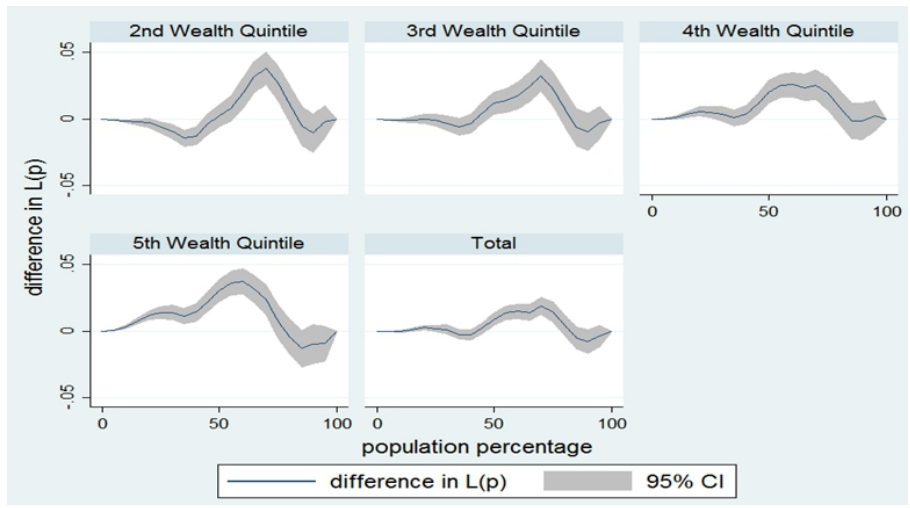
Figure 2: Contrasts and Lorenz dominance of OBA subsidies

From the findings, it is evident that the Lorenz curve of all other wealth quintiles lies above the Lorenz curve of the subsidy beneficiaries in the first wealth quintile. This means that it is positively dominated. The finding clearly shows that OBA subsidy distribution among beneficiaries in the first wealth quintile (poorest women) is unequal when compared with the OBA subsidy distribution to women in other categories of wealth quintiles. This was observed in each category as well as total women considered in the study.