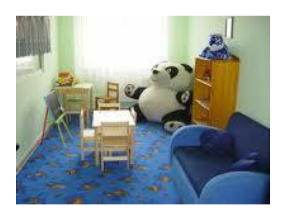
Fig. 1. Blue room – a child-friendly interview room for interviewing young victims of violence

An important part of actions aimed at improving witnesses' protection is to provide proper conditions for interviewing children – victims of sexual abuse and, if possible, adults – victims of domestic violence. This is done by setting up child-friendly interview rooms, the so called blue rooms. Special attention is paid to conditions and legal requirements regulating interviews with young victims. Such interview is always done by a judge together with a child psychologist and as a rule, a child can be interviewed only once, although the law provides for some exceptions in this respect. Most of such centres are equipped with matching furniture and audiovisual devices for communication between the interviewers located in two different rooms separated by a one-way mirror, as well as recording the interview, meeting all the requirements for court procedures involving minors. In 2011, there were over 420 child-friendly interview rooms. They are located at police stations, courts and prosecutors' offices.