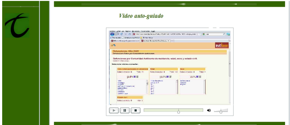
Figure 3. Video demonstration by the teacher

Although the figure of the teacher is central to the learning process, students can also approach their studies in terms of self-learning, or e-learning (Steegman et al., 2008). If appropriate materials are readily available, enabling the student to assimilate their contents, skills may be acquired by this means. In the case in question, the students can carry out the online practices with the help of the teacher, as explanatory video tutorials have been embedded into the website, using software created for this purpose (RealSpeak, by SodelsCot, 2013). Thus, the teacher demonstrates each area to be practiced (Huete, 2010) and the student can review it any time, anywhere (Fig. 3). These practical demonstrations are recorded in Excel and have been made as automated as possible (using programming language), with the aim of enabling the students to perform the practical exercises without difficulty, and bearing in mind that these students do not have a strong mathematical background and that no specific software exists to create such demonstrations.