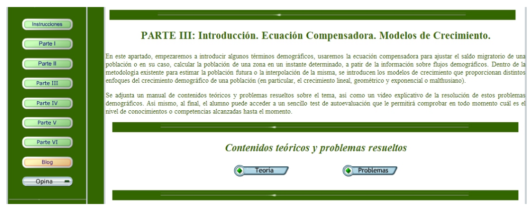
Figure 2. Blended learning materials