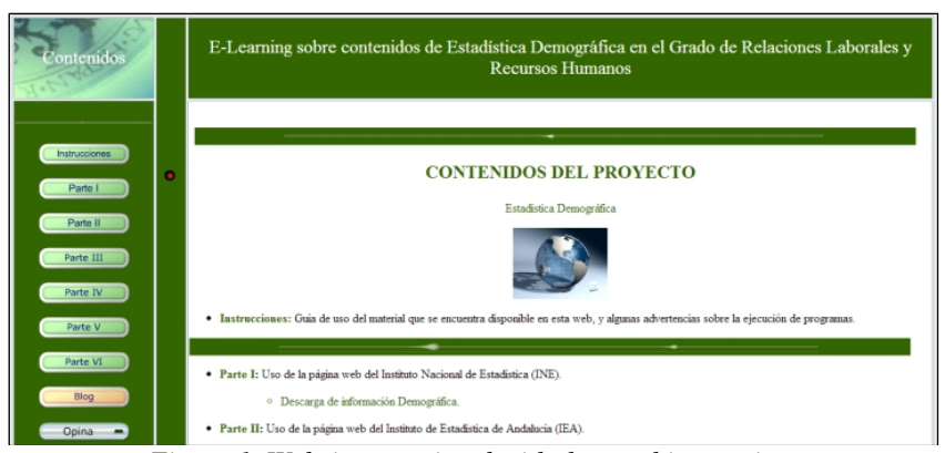
Figure 1. Website associated with the teaching project

First, the students enter an open-access website (http://www.ugr.es/~ mdhuete/E-Learning/ - see Fig. 1), which contains the materials developed for this e-learning project. The site was created using Adobe DreamWeaver CS3 and/or HTML and Visual Basic. It presents the theoretical and practical subject content, divided into seven sections, from which the student can freely select. The website also contains a blog with the latest news on demographic phenomena published by statistical institutes. The blog also includes a glossary of terms related to the main concepts used in this field and some useful links in this respect. Students can complete an (anonymous) opinion survey on the project and send it to the project coordinator.