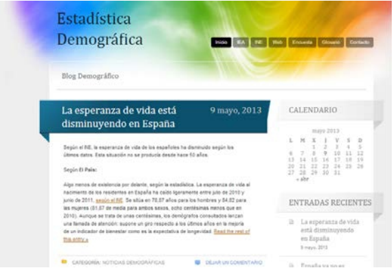
Figure 5. Demographic statistics blog

To enable fluid communication, a blog was created (Fig. 5) by means of which teachers and students can share ideas, knowledge and news about demographic phenomena, and thus maintain permanent contact in this area.