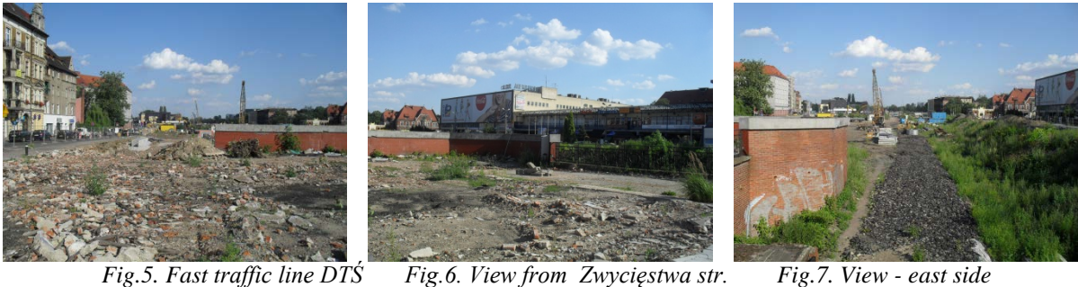
Fig.7. View - east side Fig.6. View from Zwycięstwa str.