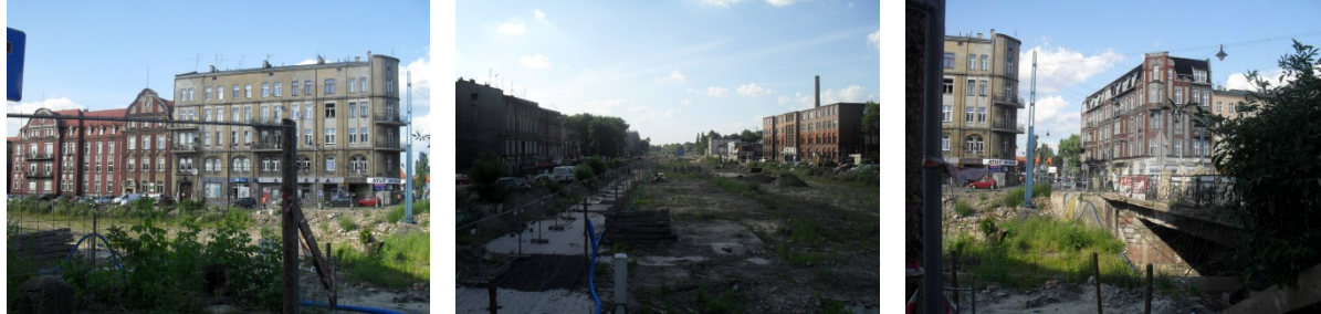
Fig.8. View from Zwycięstwa street Fig.9. View - west side