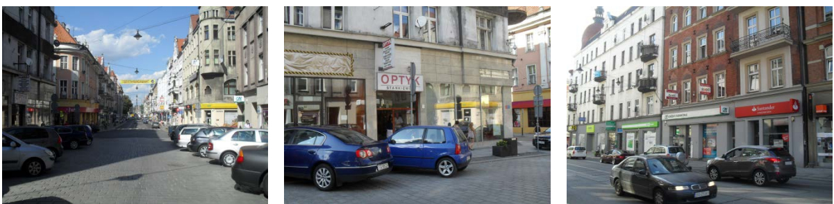
Fig.1. Zwycięstwa Street