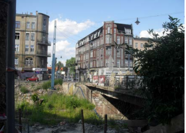
Fig.10. View from Zwycięstwa street