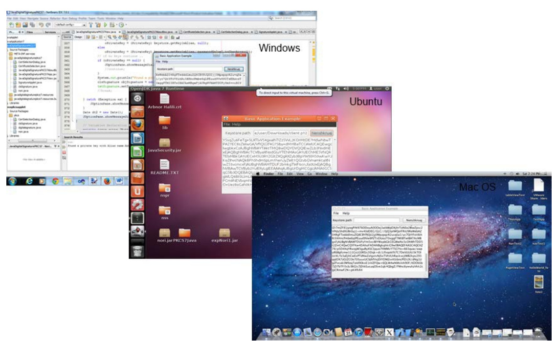
Figure 3. Screenshots from different Operating Systems (Windows, Ubuntu, Mac)

Consequently, the execution and the results will be the same in three most popular platforms worldwide. The following figure show how such a feature is visually seen<sup>166</sup>.