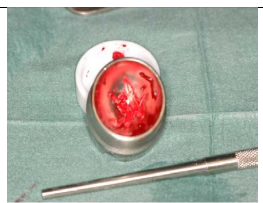
Fig.7: Autologous bone spicules obtained with UNICA osteotome.