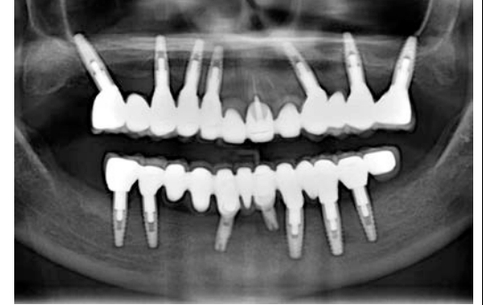
Fig.13: OPT radiograph carried out at 6 months