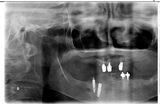
Fig.15: Follow-up after 60 days