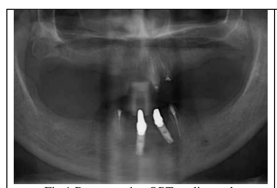
Fig.1 Pre-operative OPT radiograph