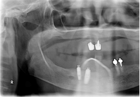
Fig.16: Follow-up OPT after 48 months