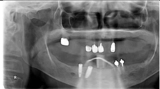
Fig.11: Post-operative OPT radiograph