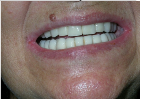
Fig.14:. Aesthetic result at the end of the rehabilitative therapy