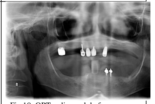
Fig.10: OPT radiograph before surgery