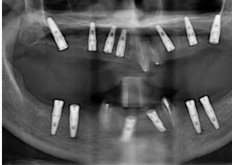
Fig.12: Post-operative follow-up OPT radiograph at 45 days following the AANT Techinique (33).