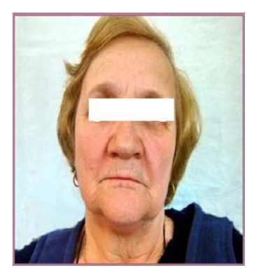
Fig.4 G.F. 71 years

Intraoral evaluation of the prosthetic field allowed us to fit them using Sangiuolo classification and Kennedy –Apllegate , Koeler-Rusov and Schroder also.The existing remaining teeth caused problems in using special devices for support, maintenance and stability.