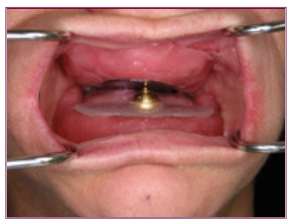
Fig.11-determining centric relation We used overdentures were teeth were correct treated and covered with capes.