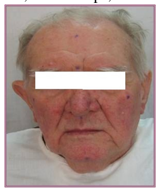
Fig.2 I.P. 82 years