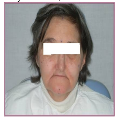
Fig.1I.C. 76 years

The oral exam showed facial changes caused by age and edentation:lower inferior floor, facial asymmetries,stressed wrinkles and ditches, reduced lips, etc