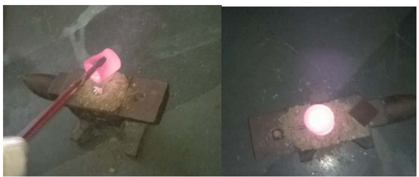
Figure: a) Crucible with the crystal at 910 °c