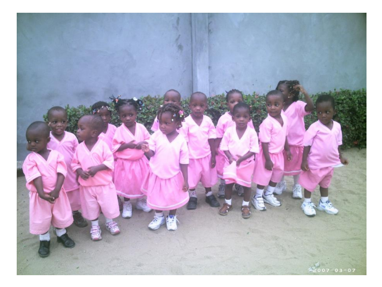
Fig.2: Playground - Free from hazards

building, each part of the building should have correct orientation as to natural favour ventilation.