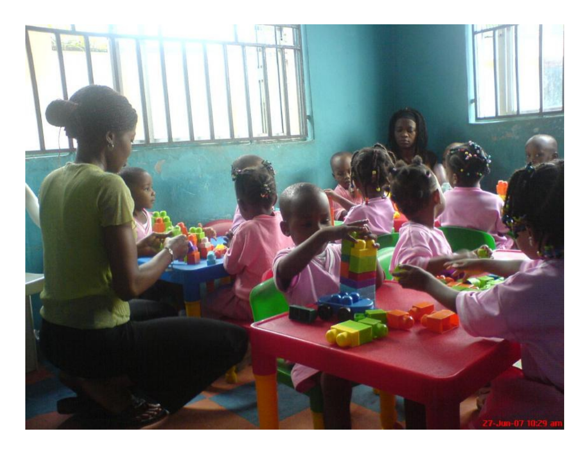
Fig.1: Utilisation of Instructional materials - manipulation of building blocks

Storing Materials - Materials should be stored where they are most frequently used, or where it is first used and located in logical place. Children can go and get things themselves to complete an assignment if they know where they are located. This is most important for common items like paper, crayon, scissors, and the like. Children will find it difficult selecting materials on crowded shelves. Sometimes it is unsafe. Materials should be displayed on low open shelves accessible to the children.