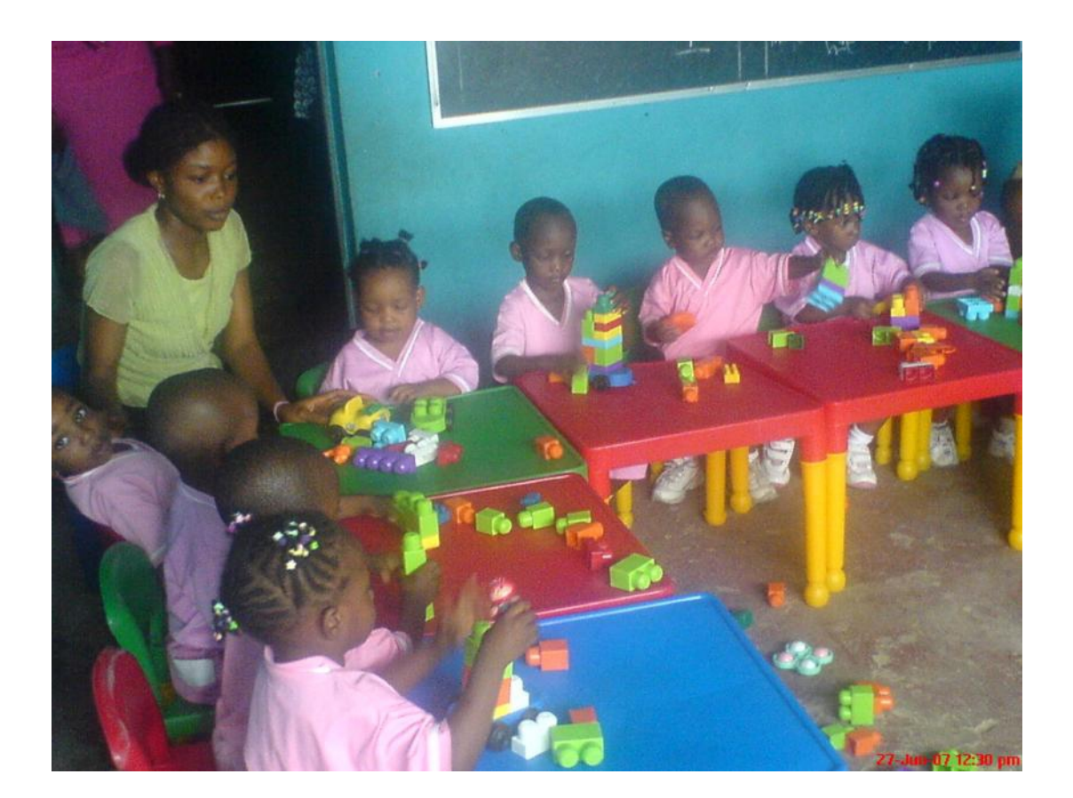
Fig. 5: Organised material utilisation - adequacy of materials