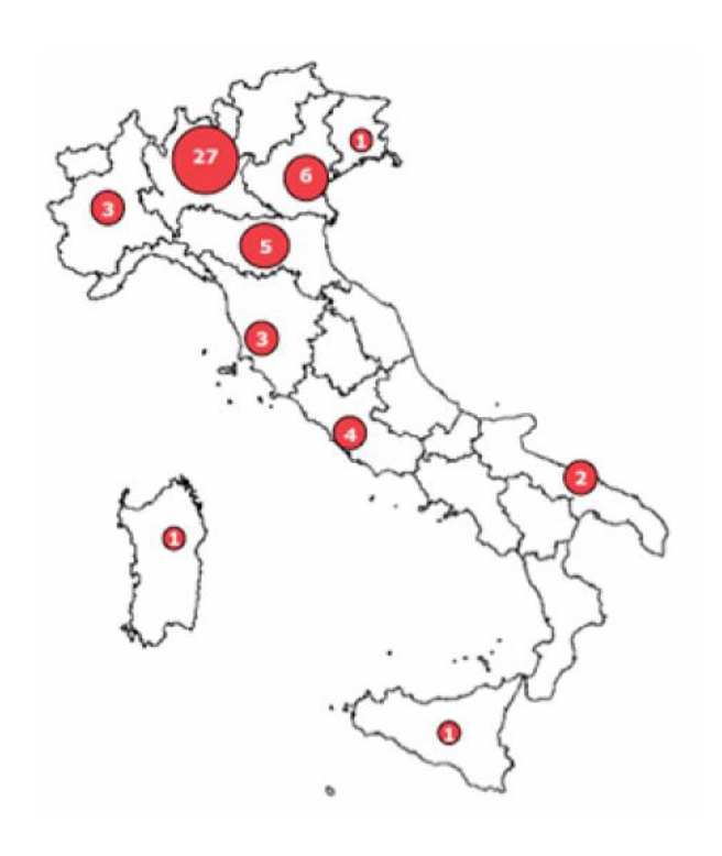
Figure 1 Geographical distribution of Russian owened Italian compagnie (n.)