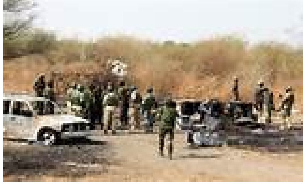
Plate No. 2: Nigerian troops in Sambisa Forest

insurgents created different make shift camps in the forest which they use and later abandoned means those parts of the forest is partially degraded.