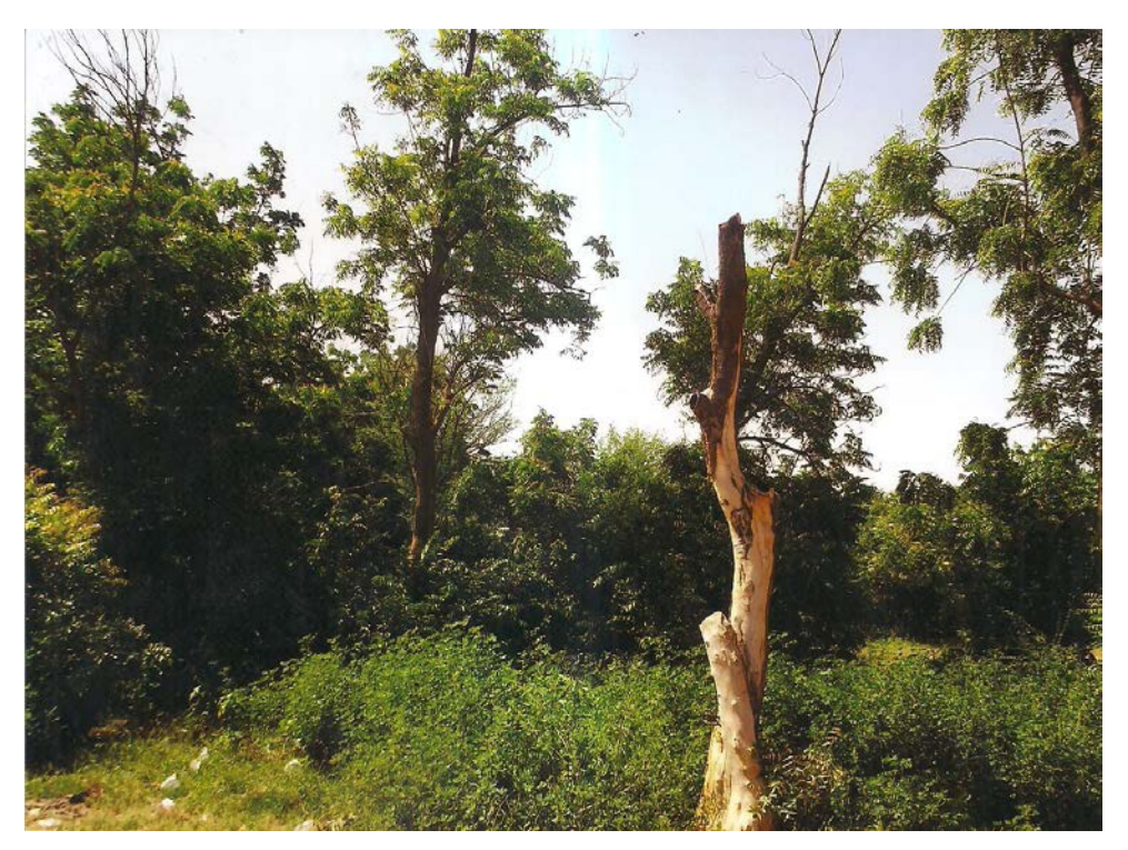
Plate No. 1: Remnant of Kabakawa Forest Reserve, Katsina metropolis

Kagoro forest is southern Kaduna state, precisely along Kaduna-Kagoro-Jos road in Kaura local government. The forest posed security threat as it is the place where gunmen camped and launch their attacks from there. For example gunmen numbering over 40 armed with dangerous knives, guns and other sophisticated weapons invaded three villages in Kaura local government on 21<sup>st</sup> March 2014 shooting and setting houses ablaze. The gunmen reportedly killed 119 persons including women and children (Bashir and Suwo, 2014). Again on 23<sup>rd</sup> June 2014 gunmen suspected to be Fulani herdsmen camping in the Kagoro forest attack several communities in the neighbouring Sanga local government reportedly killing more than 150 people in 12 villages (Buhari, 2014). Most of the gunmen wear camouflage uniforms that enable them to move through the forest without been detected easily as they more to carry out these attacks on innocent people.