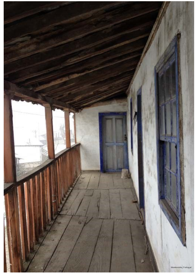
Figure 3. Balcony/horizontal distribution.

When placed on the street level transition spaces provide shelter from wind, rain or snow and when on higher levels they serve as display cabins for "street seeing" and are commonly used when religious events happen or when the village fiestas are celebrated. On summer, these spaces offer a cooler exterior sheltered space where people gather around on the end of the day. Balconies (Figure 3) are an important architectural element as they are responsible for the horizontal distribution, working as an internal/external distribution corridor. Two storey buildings often have no interior stairs which means both horizontal and vertical building's distribution is made throughout the interior/exterior balconies.