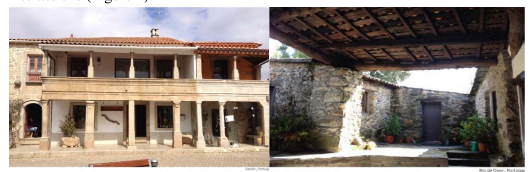
Figure 2. Transition oriented spaces examples.

To prevent solar exposure radiation from heating the glass surfaces and the inertia stone walls (which have widths between 60cm to 1,40m) there are several architectural construction techniques used such as sheds, occlusion devices (shutters) and trees or other types of vegetation. Transition oriented spaces as balconies, porches, arcades and others offer shelter from the meteorological elements when entering or exiting a building, offering "in between" multi-use livable spaces that are the heart of the settlement's social interactions (Figure 2).