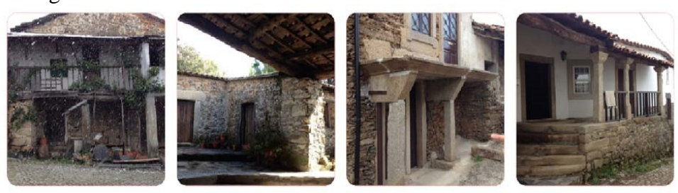
Figure 1. Transition oriented spaces from the cross-border region.

energy is not wanted and solar radiation gain is to be minimized, particularly on the glass surfaces.