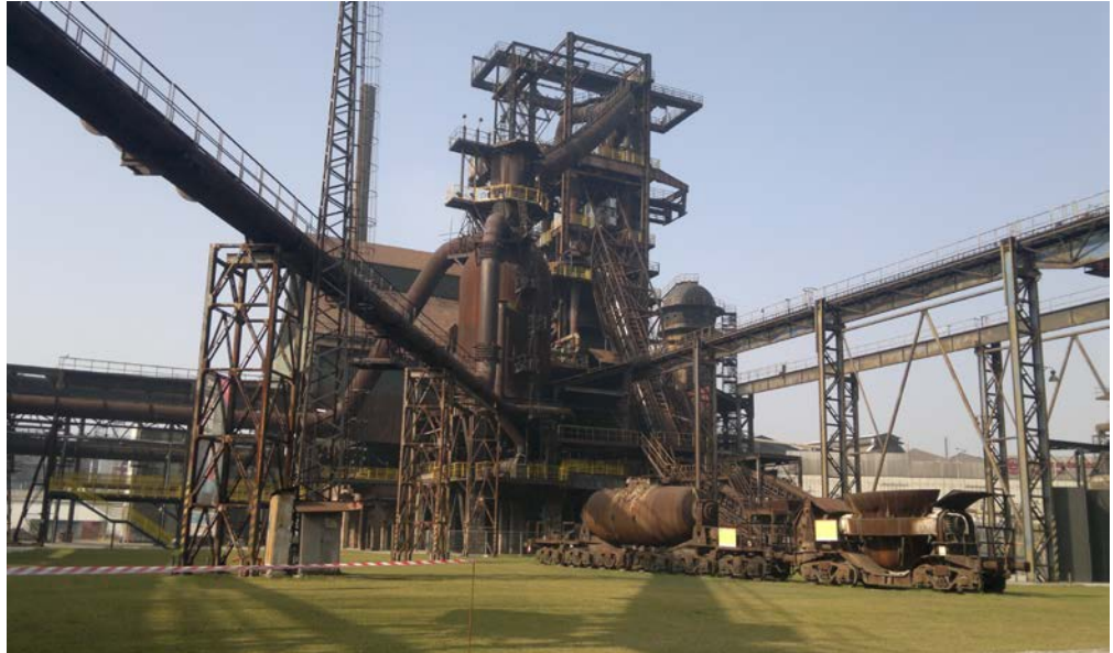
Fig.1 The Lower area of Vitkovice

became acquainted with a project that will make use of a new national cultural monuments Vitkovice and ruled in favor of its adoption. At the same time Vitkovice presented the award of the European cultural heritage project for New Vítkovice. Presenting the award there was said that he considers Ostrava Capital industrial herritage in the Czech Republic and explained why the Ministry has decided to support the proposal Vitkovice, as: "In the past