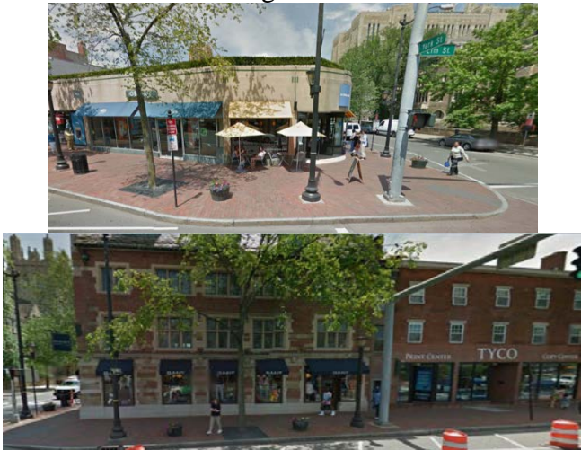
Fig. 1. Elm street segment is identified as the most important and intensively used urban space in New Haven

between Broadway and York streets was the most important and mostly chosen route (Fig. 1). This street segment is in the Downtown of New Haven connecting many important routes within and outside the city, with boutiques, bars, apartments above them, on both sides of the segment, also a grocery shop in a distance of a couple of steps on the next street segment, that definitely attract people. In this case, topological depth from this segment of Elm street to all other segments was calculated.