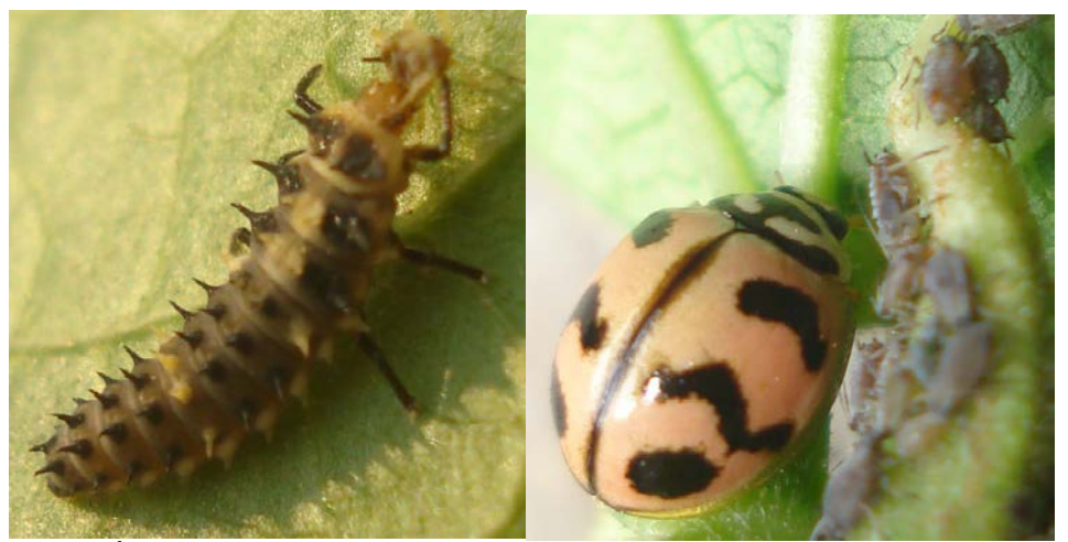
Plate-1: 4<sup>th</sup> instar consuming A. craccivora.