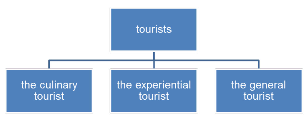
Figure 1. Tourists' segmentation

One research of tourists' segmentation revealed three types: the culinary tourist, the experiential tourist, and the general tourist (see Figure 1). The culinary tourist was identified as the tourist who, at the destination, frequently dines and purchases local food, consumes local beverages, dines at restaurants, and rarely eats at franchisee restaurants. In addition, the culinary tourist segment was more educated, earned higher income than the other two segments, and was characterized by its variety-seeking tendency towards food.