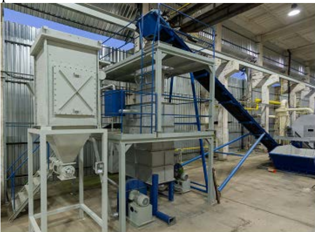
Fig. 2 Prototype of device for three-stage combustion process

In the gasification part of the unit are provided thermal and concentration conditions for the generation of synthesis gas. Increased amount of air causes the increase of the portion from gasification at the expense of pyrolysis. This reduces the thermodynamic efficiency of the process. Therefore parameters of the device need to be designed so that the pyrolysis recovery was close to the maximum value, which depends on the chemical composition of materials.