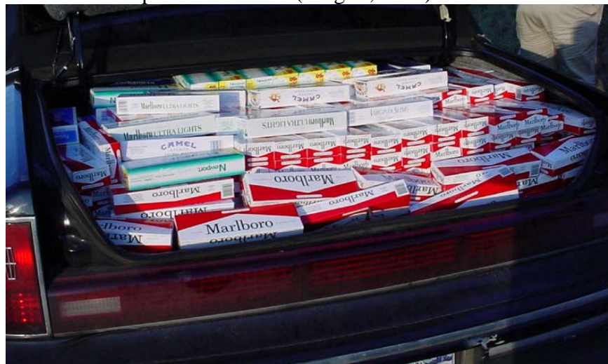
Cigarettes with "Republic of Kosovo" occupy kiosks in "Republika Srpska" and Serbia (Presheva Online, 2013).

taken to court as suspected criminals (Riegler, 2003).