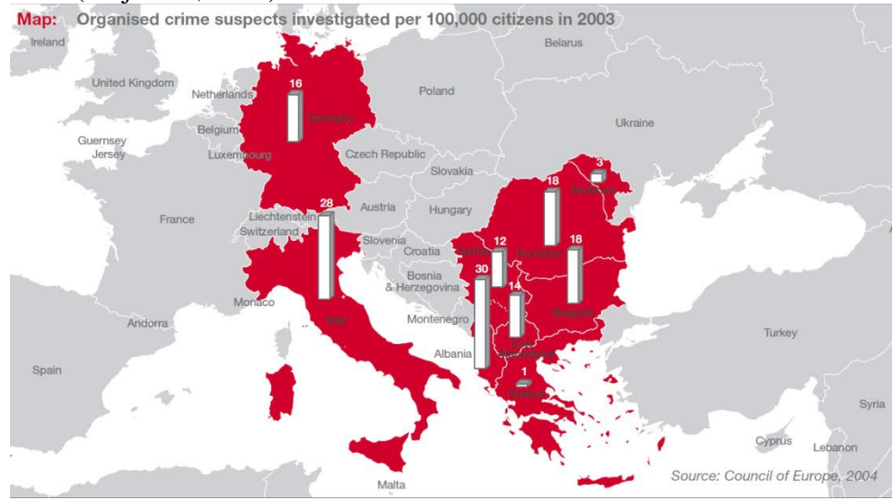
Number of suspected persons in the involvement of organized crime per 100,000 inhabitants in 2003 UNODC, Crime and Junior Impact on the Balkans, Vienna International Centre 2008. p.12