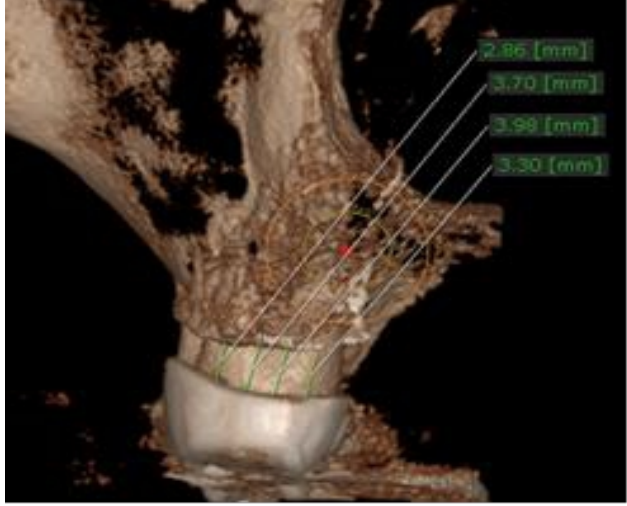
Fig.4 CBCT image - second upper molar (2.7), measurement of the alveaolar bone loss on the distal molar side.

The second upper molar (2.7) exact measures of the vestibular alveolar bone loss in 3 points were: 3.18mm middle-vestibular, distal-vestibular 3.38mm, mezial-vestibular 3.95mm (fig.2), and the oral alveolar bone measurement were: distal-palatal 4.83mm, mesio-palatal 4.75mm and middle-palatal 5.84mm as shown in fig.3. The 3D rotation of the CBCT software features showed the distal alveaolar bone for the second upper molar (2.7). the distance form the crown gingival margin to the alveolar bone was measured in 4 points (fig.4) from the vestibular to oral side in this order: 2.86mm, 3.70mm, 3.98 and 3.30mm. Influencing the final diagnosis the intraoral X-ray concealed the vestibular vertical resorbtion for the first upper premolar and the furcation involvment for the second upper molar.