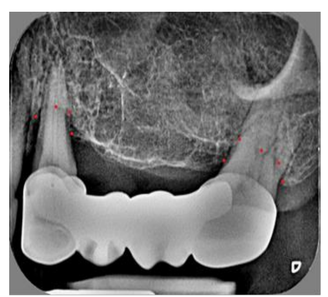
Fig.1 Digital retroalveolar X-ray - first upper premolar and second upper molar (2.4, 2.7), the possible position of the alveolar bone shown with red dots.