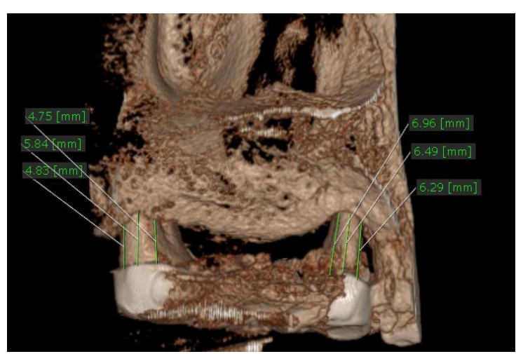
Fig.3 CBCT image - first upper premolar and second upper molar (2.4, 2.7), measures of the oral alveolar bone loss.

The second upper molar (2.7) exact measures of the vestibular alveolar bone loss in 3 points were: 3.18mm middle-vestibular, distal-vestibular 3.38mm, mezial-vestibular 3.95mm (fig.2), and the oral alveolar bone measurement were: distal-palatal 4.83mm, mesio-palatal 4.75mm and middle-palatal 5.84mm as shown in fig.3. The 3D rotation of the CBCT software features showed the distal alveaolar bone for the second upper molar (2.7). the distance form the crown gingival margin to the alveolar bone was measured in 4 points (fig.4) from the vestibular to oral side in this order: 2.86mm, 3.70mm, 3.98 and 3.30mm. Influencing the final diagnosis the intraoral X-ray concealed the vestibular vertical resorbtion for the first upper premolar and the furcation involvment for the second upper molar.