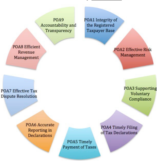
Figure 6: Performance Outcomes Area in according to the Tax Administration Assessment

Tool