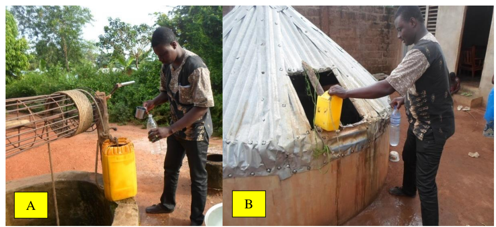
Photo 1 : Session of taking well water in big diameter at Sékou village (A) and tank at Hinvi (B) Shooting: Idani, in November, 2016

Nitrates (NO3-), nitrites (NO2-), ammoniacal nitrogen (NH4 +), total iron (Fe) and aluminum (Al3 +) were determined by colorimetric determination using a spectrophotometer (DR / 2800). Principal Component Analyzes were used to analyze the relationships between the parameters tested.