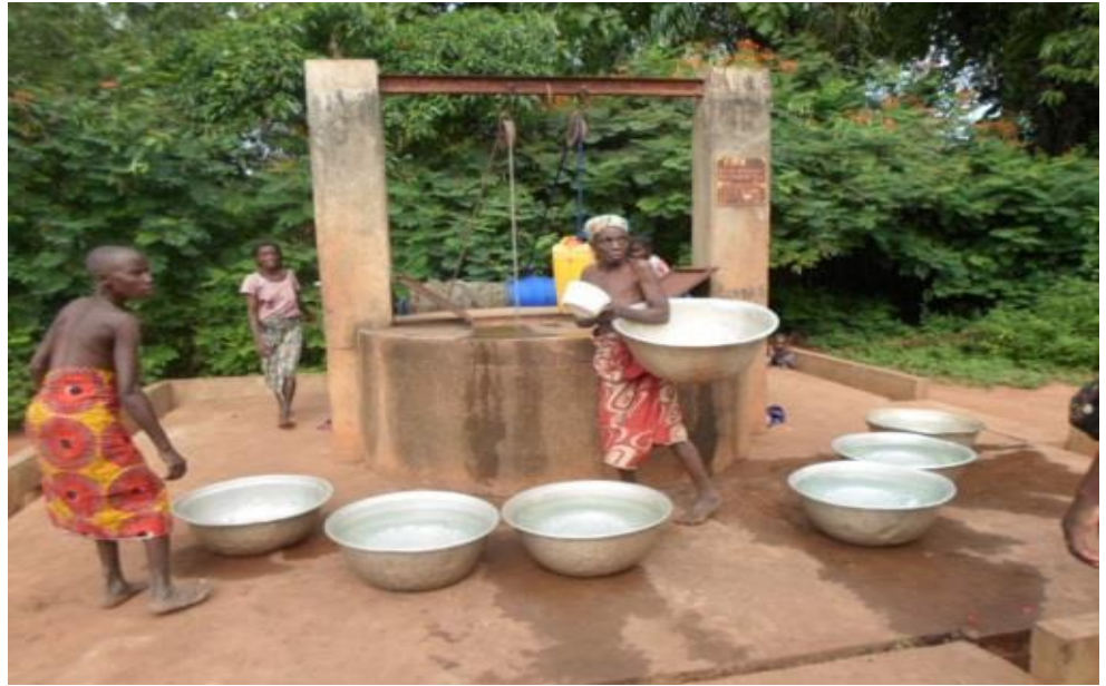
Photo 2: Women looking for drinking water at an unconditioned well in Lissègazoun in November, 2016

25 ° C. It follows then that all the samples analyzed have an unusual temperature. These results are consistent with those of Degbey et al. (2010). For pH, it is also apparent that all sampled sources have a pH value below the nationally recognized limiting range. Only tank 1 respects the guideline value with 6.89. All sources have a slightly acid pH (pH<6.5), except for tank 2 which has a basic pH with a value of 9.14. Conductivity for all sources meets the standard. Global mineralization varies from medium to high. We find that mineralization is more important in well water than in the waters of boreholes and tanks (Tanouayi et al. , 2015). The same applies to dissolved total salts, turbidity and color which also comply with guide values. It should be pointed out that well 2 has a turbidity value to be monitored (4.53 against a normal of 5); the color also is 18.7 instead of 15. Also there are certain practices of the indigenous population that participate in affecting the physical quality of the water. These include bushes around water points or lack of cleaning (photo 2).