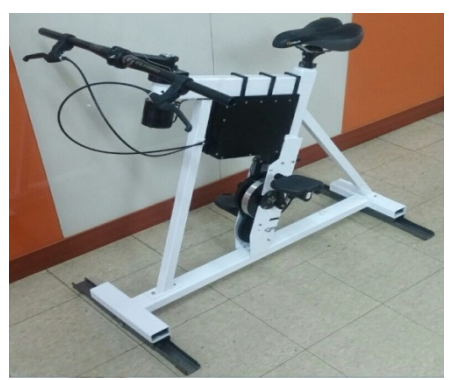
Figure 2. A Prototype of a VR Indoor Bike