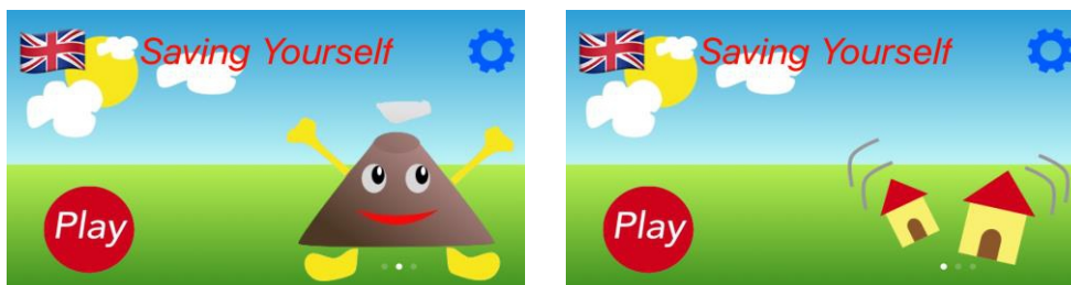
Figure 1. Saving Yourself versions for volcanological and seismological emergency.

From the methodological experience of Learning on Gaming, derives an App to improve Earth's Sciences, particularly Geophysics, and above all to improve environmental and safety education (Fig. 1).