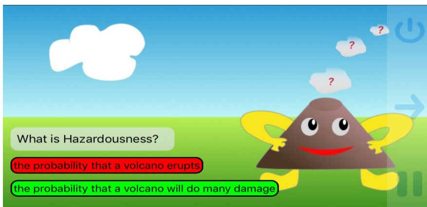
Figure 4. Immediate feedback: wrong answer is indicated in red, while the correct answer appears in green.

With GIFs, the geophysical mechanisms are clarified (Fig. 5), so it is easier to defeat frequent misunderstandings. In particular earthquake version aims to get aware and responsible informations, to avoid panic, to keep a healthy caution.