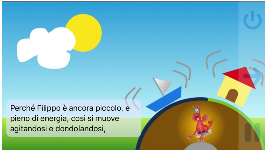
Figure 2. Methodology is storytelling, gaming, use of information and communication technologies, innovative teaching.

All Saving yourself apps are enriched with original designs, suitable for the