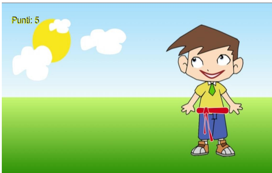
Figure 3. Another engage element is multiple game levels, with different prizes: a green belt, a red belt, a blue belt, a safety star.