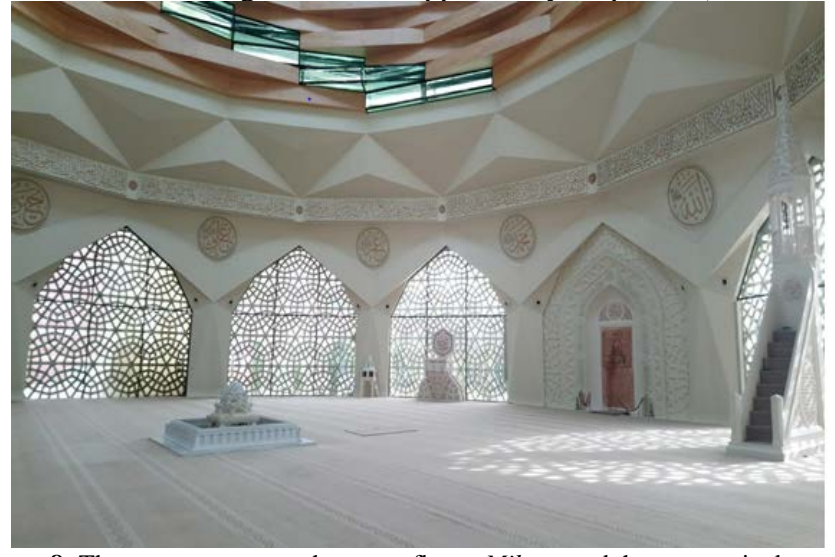
Figure 8: The prayer venue on the upper floor. Mihrap and the geometric decorated shading insides linking the pillars (Alev Erarslan)

Accessed from the Mahir Iz Avenue façade, the upper floor of the building features a triple section riwak in front, which is once again comprised of Turkish triangles, sitting atop four columns (Figure 1). Having assumed the task of entrance, there are two entrances beneath this riwak, situated to the right and left of the structure, which are crafted from the modern kündekari technique, with trunks designed to look like Seljuq victory gates. The main prayerping space on the upper floor features a dodecagonal layout set up with 12 concrete pillars with Turkish triangular trunks. These pillars are linked to each other with pointed arches. The glass of the arches is coated with sunscreens decorated with geometric girih artwork comprised of polygonal star compositions. Consequentially, pointed arches, the insides of which feature geometric decorations, make up the dodecagon of this floor's façade (Figure 8). The design of this façade ensures a distinctive illumination of the interior spaces with light and shadows. The insides of the arch corner pieces feature medallions that were inscribed with the 'Names of Allah' ( Esma-ül Hüsna ) in ' celi sülüs ' style by mosque calligrapher Hüseyin Kutlu (Figure 8, 10). This dodecagonal layout prayer venue is covered by a dome measuring 32-m. wide and 35-m. high which is supported by 12 pillars (Evren, 2009).