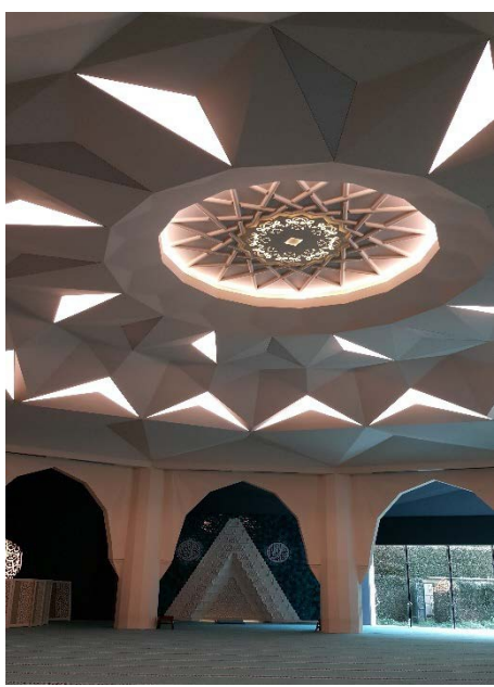
Figure 6: The mihrap which is positioned behind the ambulatory corridor on the lower floor (Alev Erarslan)