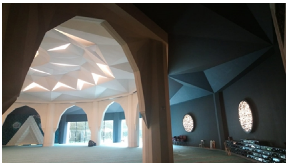
Figure 5: The ambulatory corridor encircling the main domed venue on the lower floor and the medallions in the walls of the ambulatory corridor (Alev Erarslan).

The mihrap of this floor was imbedded into the center of the qibla wall, behind the structure's ambulatory corridor. The mihrap was positioned between the structure's central domed dodecagonal main prayer space and one of the segmented arches that link the polygonal pillars supporting the dome (Figure 6). Garnering attention for its unique design, the mihrap edges feature a segmented triangular shape. Fashioned from fiber-reinforced concrete, there are inside-out Turkish triangles, hexagonal stars and borders comprised of hipped, pointed arches around its surface. Embellishment comprised of hexagonal stars inside the niche arch is found in the center of the mihrap, whereas the surface around the niche is covered with turquoise tiles. The 115th verse of the Bakara Sura, which reads "fe eynema tuvellu fe semme vecullah", which means "Allah is everywhere you look" inscribed in 'celi sülüs' within the medallions on either side of the mihrap (Figure 6, 7). The mihrap has been illuminated by ensuring natural lighting with a garden situated in line with the qibla wall. For this reason, the wall on this side is comprised of a glass surface in order to illuminate the mihrap with natural light (Figure 5).