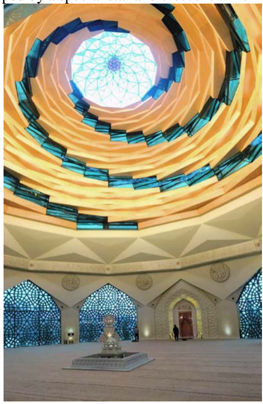
Figure 9: The swallow dome with 'Wheel of Fortune' ( çarkıfelek ) glass luminuous intervals covering the upper floor praying space and mihrap and fountain (Emre Duyan).

also ensure the structure receives natural light. The octagonal luminous glass skylight in the center of the dome is unique to Turkish architecture, its surface is also composed of Turkish triangles. The six intertwining vav inscriptions are striking in the heart of the dome (Figure 9). The transition element to the dome is a Turkish triangle belt found on the dome hoop. Each of the dodecagonal surfaces of the dome hoop are inscribed with examples of 'celi sülüs' style calligraphy. The light-shadow façade and the glass used in the covering constitute the strongest source of natural light on this floor. The steel dome pinnacle is topped by a special star and crescent which lights up at night.