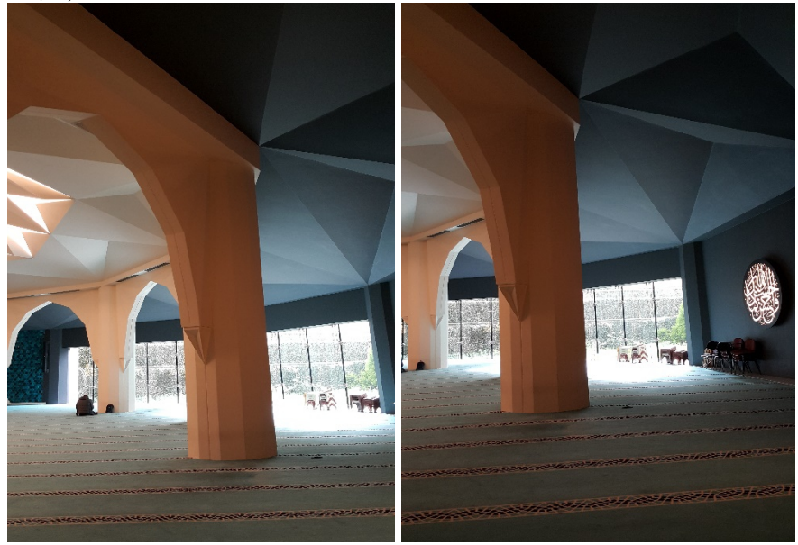
Figure 4: The ambulatory corridor encircling the main domed venue on the lower floor and one of the medallion in the walls of the ambulatory corridor with its Turkish triangular cover (Alev Erarslan)

Islamic architecture. Once again, the main space features a covering system comprised of Turkish triangles above the ambulatory corridor which encircles the main space (Figure 4). Celi sülüs style Koranic verses inscribed in medallion are found on each surface of the dodecagonal walls of the ambulatory corridor, painted black and illuminated with a barrisol ceiling (Figure 4, 5).