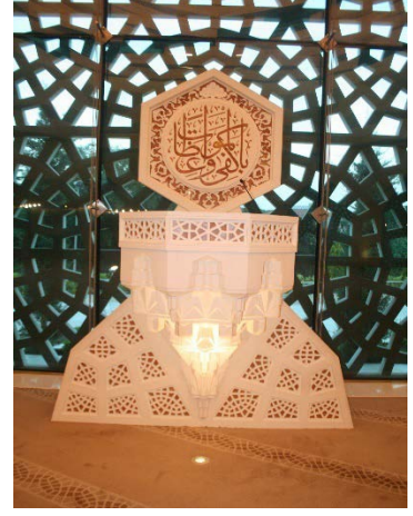
Figure 11: The pulpit ( minber ) of the upper floor prayer venue and the kürsü (Alev Erarslan).