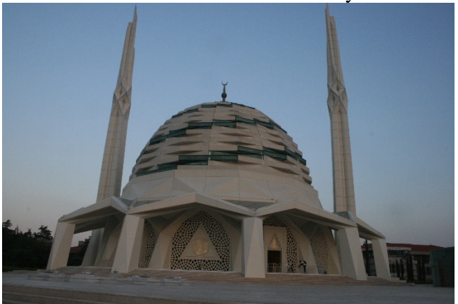
Figure 1: Marmara Ilahiyat Mosque (Alev Erarslan)

Theology and designed by the founder of the Hassa Architecture Bureau, Master Architect Muharrem Hilmi Şenalp, who was also responsible for designing important buildings such as the Tokyo Mosque and Turkish Cultural Center, the Berlin Martyrs' Mosque and Cultural Center, the American Religious Center as well as the Istanbul Museum of the History of Science and Technology in Islam. Constructed in 2015, the structure is situated on land covering around 30,000 m², including the front square and the cultural center beneath (Figure 1). As part of the Marmara University Theology Faculty complex, the building has 8,500 m² of indoor space. In addition to serving as a house of prayer, it is also a culture center which provides opportunities for social and cultural activities such as an art gallery, classrooms, faculty member rooms, a library, an auditorium, exhibit halls, a bookshop café, cinevision rooms as well as a carpark (Uzun, 2010). The complex also offers charity sales, and special social, educational and cultural activities geared towards women and children. Established on triangular-shaped premises, the complex features auditoriums on three sides. The ablutions station on the west side has room enough to handle 134 ablutions simultaneously.