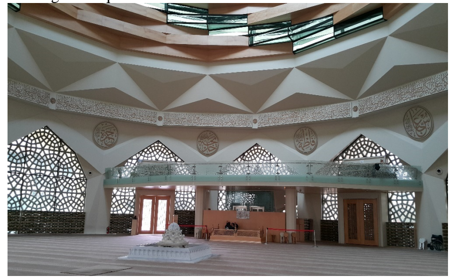
Figure 12: The women's gallery towards the top floor entrance and the fountain beneath the dome (Alev Erarslan)

front of the single-floor women's gallery. Inscriptions of Hatice r.a and Fatima r.a are written in the medallions in the walls of the women's gallery. The structure has two doors that open into the main praying venue and were produced with glass surfaces, using the modern straight 'kundekari' technique. building's elevator was positioned between the pair of entrance doors on both floors and was produced on glass using a geometric decorative sandblasting technique.