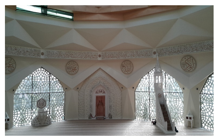
Figure 10: The mihrap , pulpit ( minber ) and sermon dais ( vaaz kursu ) of the upper floor prayer venue (Alev Erarslan)

Once again, the pulpit of the mosque's upper floor praying area was made from fiber-reinforced concrete, whereas it features a large star composition in the center of the side mirror with a colorful rumi-palmette band around it (Figure 11). The pulpit has a bannister and geometric girih art comprised once more from stars is seen in the pulpit pavilion. The surface of the cone of the pulpit pavillion is decorated with rumi-palmette motifs. The muezzin gallery situated to the east of the pulpit was made from fiber-addititive concrete materials and features a hexagon backboard, and eight-point star balustrade and is in the manner of the gallery's sub-muqarnas console. Again, the gallery pedestals are comprised of multi-branched stars.