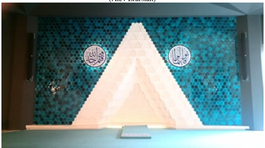
Figure 7: The mihrap in the lower floor and the medallions (Alev Erarslan)

The women's gallery of this floor is in the building's eastern end, inside the ambulatory corridor in this direction and separated by a wooden partition painted in white and covered with geometric systems composed of polygonal stars interwoven with Shahi spots ' çintemani ' and double-striped Pelengi motifs (Figure 3). One enters this floor via a pair of double-winged doors crafted in the geometric ' kündekari ' technique on other side of the elevator. There is celi sülüs style calligraphy inside the cartridges over the door trunks which were designed in the style of Seljuq victory gates.