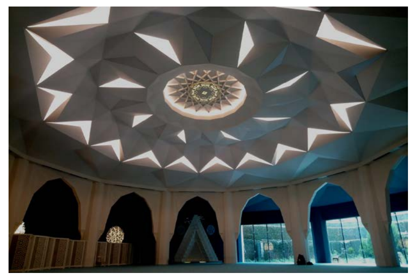
Figure 3: The lower floor praying space. Next to it, is the inner garden which provides the mihrap natural light (Alev Erarslan)

Islamic architecture. Once again, the main space features a covering system comprised of Turkish triangles above the ambulatory corridor which encircles the main space (Figure 4). Celi sülüs style Koranic verses inscribed in medallion are found on each surface of the dodecagonal walls of the ambulatory corridor, painted black and illuminated with a barrisol ceiling (Figure 4, 5).