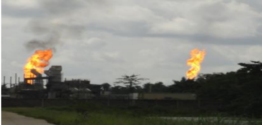
Gas Flare in Obagi (2004)