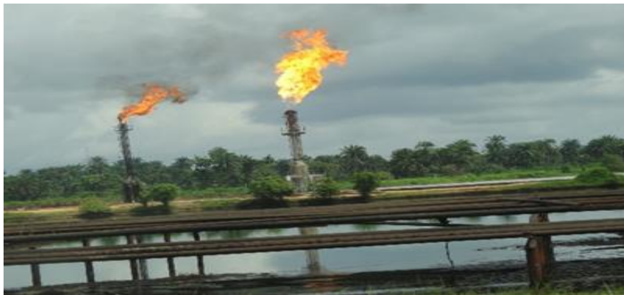
Gas Flare in Omoku (2014)