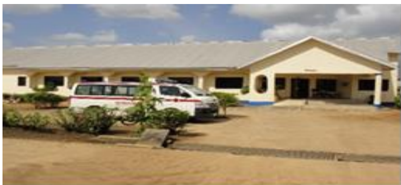
Hospital Building (2014)

The lack of social and economic development explains why Apter (1998) noted that what oil companies brought to the Niger Delta has not profited the indigenes but has polluted the environment, contaminating the mangrove swamps and farmlands with seepage and spills, while fouling the air with black smoke and lethal gases from flare-offs that burned day and night. Corroborating Apter (1998), we also observed gas flares during our 2004 and 2014 fieldwork in the Niger Delta region. See pictures below: