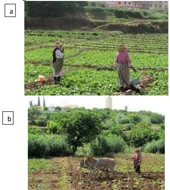
(a). Market gardener in the valley of the oued Boufekrane (May 2012). (b). Market gardens in the valley of the oued Bouisshak (June 2013) Figure 2. Use of the traditional techniques in market gardening (Dugué et al., 2015)

maximum (Table IV). The low scores for "direct contribution to employment" re associated with the lack of permanent labor (Rhaidour, 2013). Producers resort to casual labor when necessary. Furthermore, the weakness of collective work can be explained by the fact that production is practiced in urban areas where solidarity is rare. Most farms (97.63%) have a socio-territorial sustainability score below 65. About 77.54% of the farms have a socio-territorial sustainability score between 55 and 65 points out of 100. The low scores of socio-territorial sustainability can be linked to the omnipresence of the conventional mode of production (Figure 2) and the poor development of the production areas (absence of storage buildings for equipment, often poor access to the field). This is because a large number of market garden producers operate perimeters that they do not own (Rhaidour, 2013). These perimeters are very often acquired by donation or lease, any situation that prevents significant long-term investments.