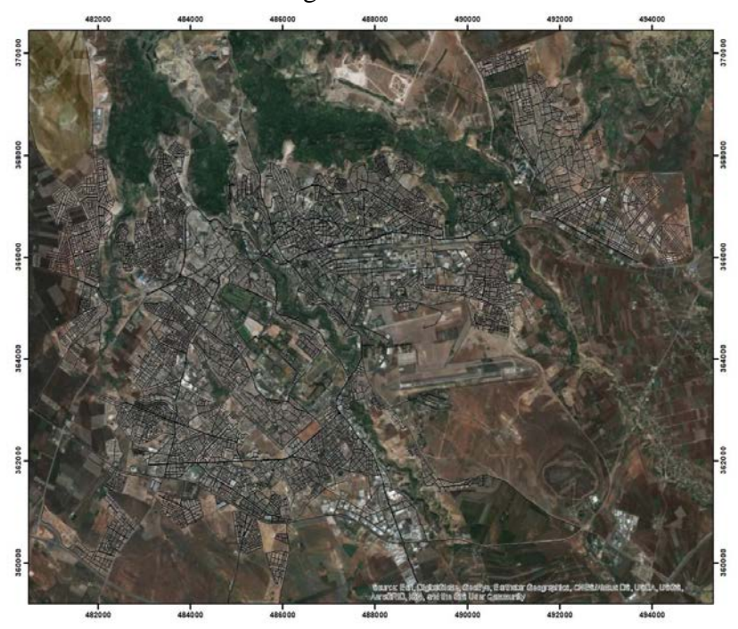
Figure 1. Geolocation of the study area

for El Addouli et al. (2008), and 913 ha according to the 1996 agricultural census (cited by Abdouh et al., 2004). The choice of this study area is due to its high contribution to local market garden production and its potential to feed the inhabitants of the Fez-Meknes region.