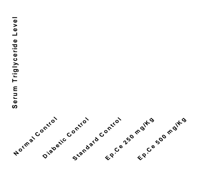
Fig 3: Effect of Euphorbia prostrata (Ep.Ce) on Serum Triglyceride levels (mg/dl) of alloxan induced diabetic rabbits