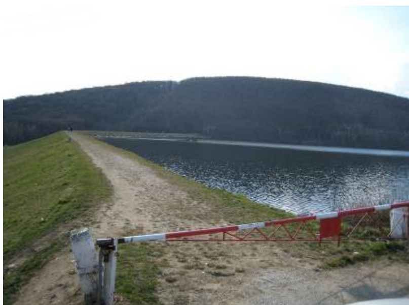
Fig.1: The earthen dam Pod Bukovcom.

The earthen dam Pod Bukovcom is built on the river Idan between villages Bukovec and Malá Ida in the Eastern Slovakia (Fig.1). The earthen dam is situated in the morphologically most advantageous profile, in the place of the old approximately 7 m high and 220 m long dam body, which was liquidated following the building-up of the up-to-date earthen dam. The industrial water supply for cooling the metallurgical furnace equipment in the company U.S. Steel Košice in a case of damages is the purpose of the dam. The water basin is also for flattening the flowing waters and for recreational purposes during the summer time.