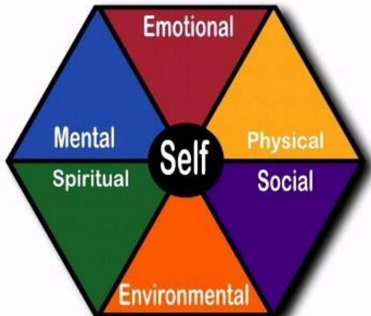
Fig. 1 Holistic Model

TSMU experience system include course development-classroom technique, student mentoring/guidance, grading development course objectives, selecting appropriate readings, developing classroom activities, developing evaluations, facilitating class discussion (e.g., staying on topic, eliciting input from all students, guiding discussion toward learning objective).