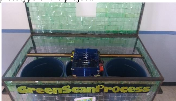
Figure 4. Prototype example.

Development: It refers to the lifting of requirements and the system model (Madariaga, Rivero & Leyva, 2016). An investigation of the properties of the objects was carried out, which will be used for their identification and classification. Thus, it makes use of the different types of correct sensors that are capable of recognizing their individual properties. A diagram of the phases of the process (container states, detection of the sensors, location of the container on the boats, etc.) was also elaborated, optimizing the tasks that are redundant and thus obtaining a maximum performance, and obtaining results in a minimum time to pass for each cycle of this process (for each object classification). Figure 4 represents an example of the prototype of the project.