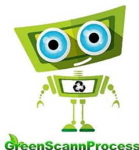
Figure 3. Example of project image