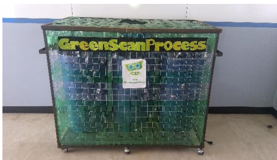
Figure 6. Prototype finished.

Delivery: This phase is characterized by the finished prototype. The duration of the project was 16 weeks. Figure 6 represents the finished prototype.