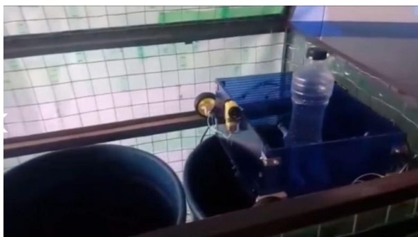
Figure 5. Example of project operation

To perform the performance tests, GreenScannProcess was applied in developing a software with a new technology called Raspberry pi 3. Basically, 3 types of sensors were used: The weight sensor will determine that there is an object in the container that we need to classify; the humidity sensor to identify organic waste; and another sensor to identify recyclable inorganic materials. A cart was developed that contains the system installed, and is able to move in the container in order to classify and deposit the waste in the corresponding boat. Figure 5 represents an example of the operation of the project.