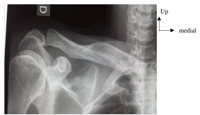
Figure 3 : vicious callus of lateral-end with shortening of right clavicle (Radiograph)