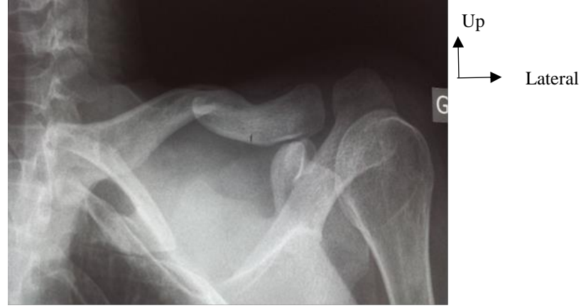
Figure 4 : vicious callus of midle and lateral-end union with shortening of left clavicle (Radiograph)