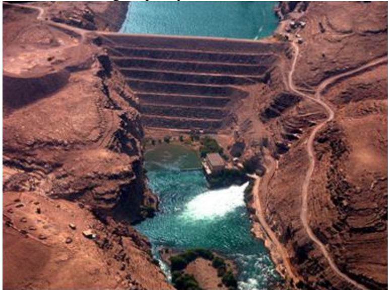
Figure 3. Kajaki dam