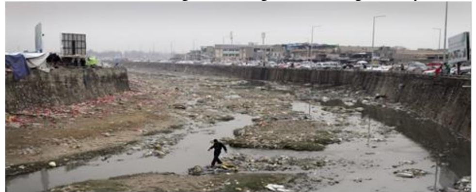
Figure 1. A part of Kabul river

40% of Naghlu dam's bowl is occupied with sand and dift (Sabaoon, 1396). The Kabul River is one of the sources of the Naghlu power Dam which are connected in the city of Kabul with a heavy load of materials. In many months of the year, the Kabul River does not have enough water. Thousands of cubic meters of materials and dirt are stored by people in the seabed (Figure 1). Thus, in the rainy seasons including March, April, and May, all of the wastes of Kabul River are transferred to the Naghlu power plant and it is stored there. In addition, the Logar River transfers animal and plant materials from Maidan Wardak and Logar to the Lugar River during the rainy seasons.