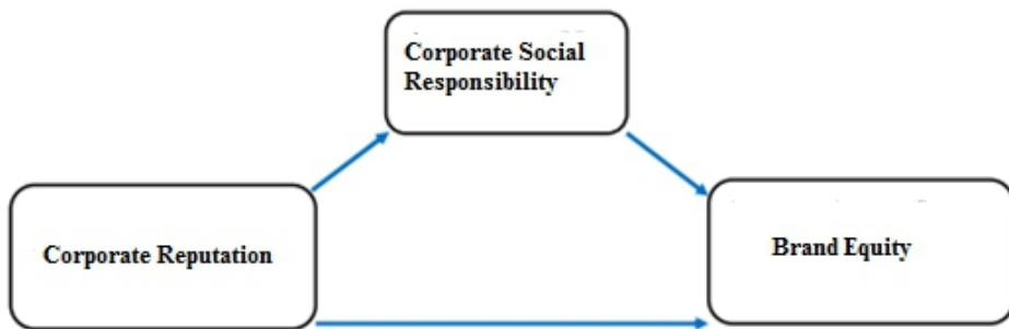
Figure 1. Research Model

The proposed model of the present research is presented in Figure 1.