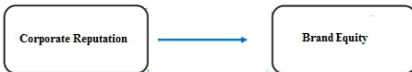
Figure 1. Proposed Model about the Effect of Corporate Reputation on Brand Equity

The effect of GSM users' perceived corporate reputation on brand equity was examined using a linear regression analysis. The research model on this relationship is provided in Figure 2.