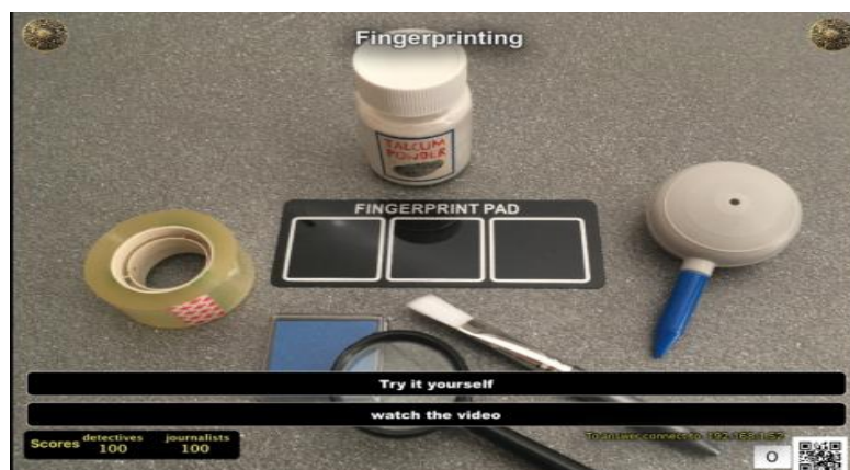
Figure1: Screenshot of one CrimeQuest page regarding a hands on activities ( fingerprint detection).

CLIL works with meaningful, challenging and authentic context that can motivate learners much more than traditional approach. Real world contexts engage students because they provide suitable learning environments for problem-based learning. CLIL scaffolding reinforces students’ learning. They need scaffolding (Böttger, H., Meyer O., 2008) in order to improve language. Scaffolding is a powerful teaching tool; in fact facilitates students in understanding the content and the language in the task and enables learners to complete exercises by providing correct supportive structures. Scaffolding, besides, supports the enrichment of specific vocabulary and entire phrase construction by providing motivation, enthusiasm and language proficiency enhancing skills. It promotes the interaction between learners that begins to communicate with each other in an authentic way, stimulating thinking skills together with a specific topic glossary. The resulting outputs consist in enhancing fluency in communication and in increasing self esteem.