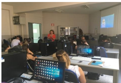
Figure 3 A whole class following the game with an IWB

The game can be played in a laboratory to accomplish one or more hands-on activities or in a classroom simulating a workshop activity.