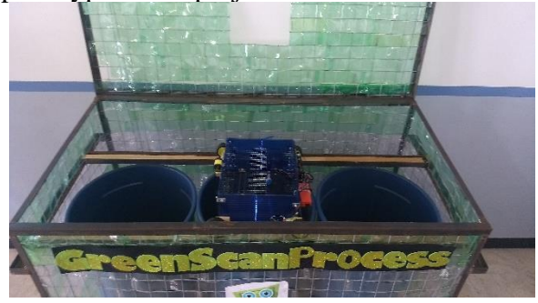
Figure 4. Prototype example.

Development: It refers to the lifting of requirements and the system model (Madariaga, Rivero & Leyva, 2016). An investigation of the properties of the objects was carried out, which will be used for their identification and classification. Thus, it makes use of the different types of correct sensors that are capable of recognizing their individual properties. A diagram of the phases of the process (container states, detection of the sensors, location of the container on the boats, etc.) was also elaborated, optimizing the tasks that are redundant and thus obtaining a maximum performance, and obtaining results in a minimum time to pass for each cycle of this process (for each object classification). Figure 4 represents an example of the project.