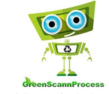
Figure 3. Example of project image

• Selection of Viable Topics to be Developed: This stage is characterized for the investigation of materials, competencies, name of the process, brands, author rights, sustainability, state of the art, needs of use, ease of use, target market (market segmentation). The project's image was developed (see Figure 3).