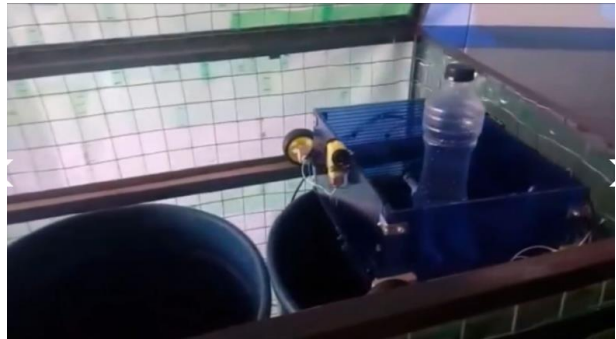
Figure 5. Example of project operation

To perform the performance tests, GreenScannProcess was applied in developing a software with a new technology called Raspberry pi 3. Basically, 3 types of sensors were used: The weight sensor will determine that there is an object in the container that we need to classify; the humidity sensor to identify organic waste; and another sensor to identify recyclable inorganic materials. A cart was developed that contains the system installed, and is able to move in the container in order to classify and deposit the waste in the corresponding boat. Figure 5 represents an example of the operation of the project.