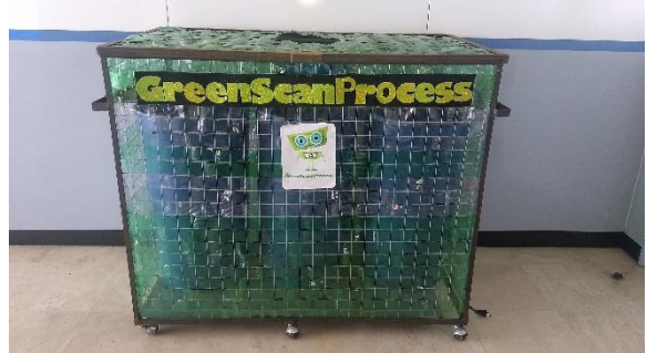
Figure 6. Prototype finished.

Delivery: This phase is characterized by the finished prototype. The duration of the project was 16 weeks. Figure 6 represents the finished prototype.