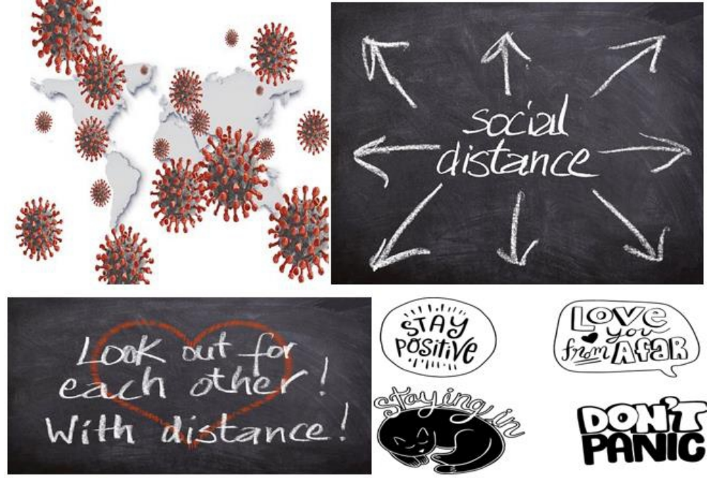
Figure 1: Guideline Images on how to Stay Safe during the Lockdown by Online Newspapers in Nigeria

intrigues and local efforts of the respective state governors and supervisory role of the Nigerian Centre for Disease Control (NCDC).