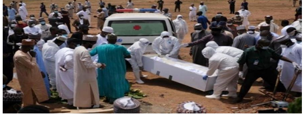
Figure 3: Online Newspaper's Image during the Burial of the late Chief of Staff to President, Abba Kyari one of the Victims of the Virus.