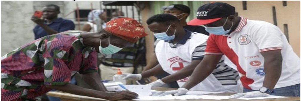
Figure 4: Online Newspapers' Image Depicting Food/Aid Distribution by Red Cross to Lagos Residents who are Victims of Hunger as a result of Complete Lockdown.