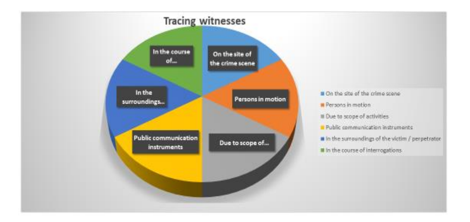
Figure 2. Tracing witnesses

In the course of investigating bodily injuries, at the stage of collecting substantive testimonies (thus at the significant part of the interrogation), the victim is advised to be asked the following relevant questions in particular: