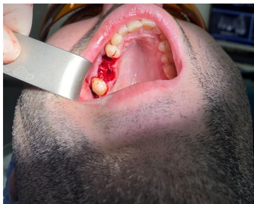
Figure 2. After extraction of the teeth