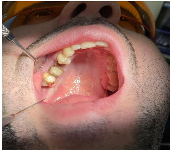
Figure 1. Condition before extraction of the teeth

During immediate implantation, the protocol for the formation of the implant socket is different and much more difficult compared to classical implantation. Here we do not have a cortical bone in the alveolar ridge area, so the initial fixation of an implant becomes difficult. In many cases, initial stabilization is simulated -- we may get enough "Torg", but the implant-to-bone contact coefficient (IBC) is quite low, which is the main determinant of osseointegration. Therefore, when the degree of primary fixation of the implant and the IBC coefficient is low, the implant should be closed with a healing screw or a former.