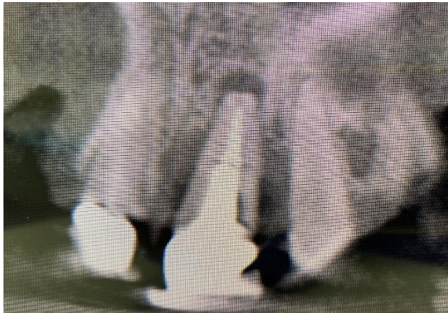
Figure 4. Before Immediate Loading of Dental Implant

The decision about the possibility of non-removable temporary construction is mostly made by the implantologist. If satisfactory initial fixation is achieved, fixation of an artificial construction is allowed.