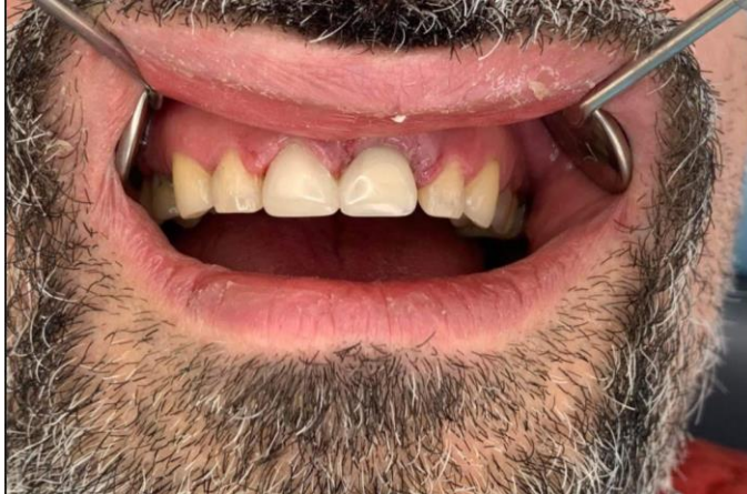
Figure 6. Temporary Restoration

There exist direct and indirect prosthetics.