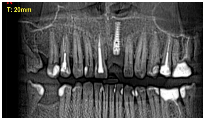
Figure 5 (X-ray After Immediate Loading)