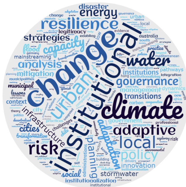
Figure 3. A visualization of the title and keywords using word cloud