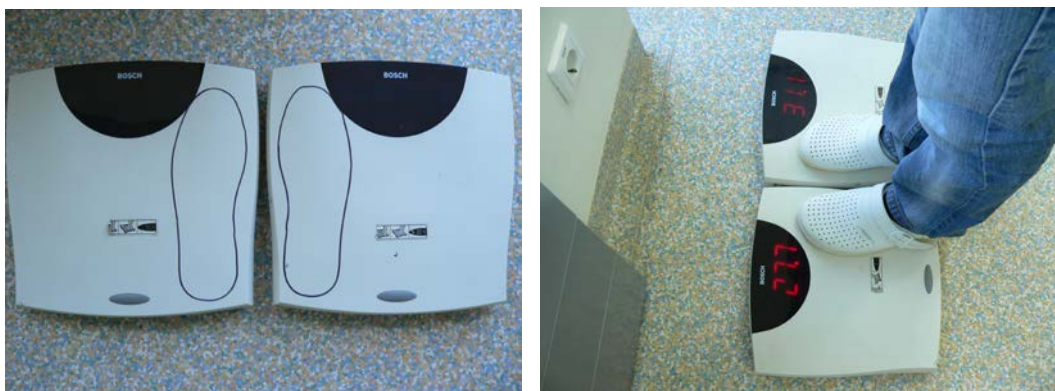
Fig.1. The postural balance evaluation

Electromyographic records of the masseter and anterior temporal muscles at rest and during mild isometric contraction, before and after immediate insertion of the Aqualizer® device, were made using the BioEMG II electromyograph (BioResearchInc, Milwaukee) (fig. 2,3,4). The mean amplitude of the signals in all of the registration conditions, as well as the results of the postural balance examination, were enrolled tables.