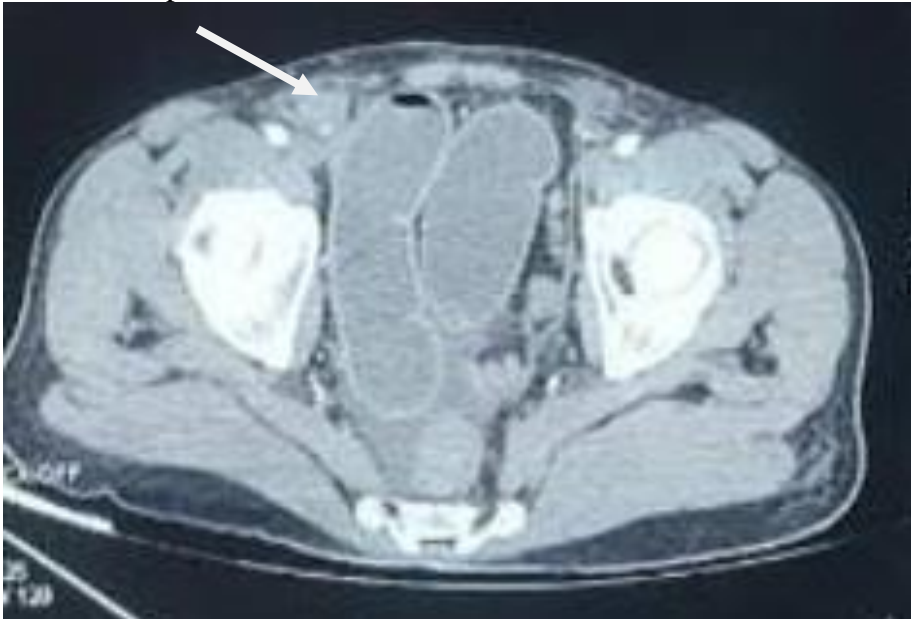
Fig 2. CT scan depicting a bowel loop herniating into inguinal hernia

defect. Absence of pneumoperitoneum. Small peritoneal effusion at the level of the pouch of Douglas. The collapsed appearance of the colonic frame and the last ileal loop.